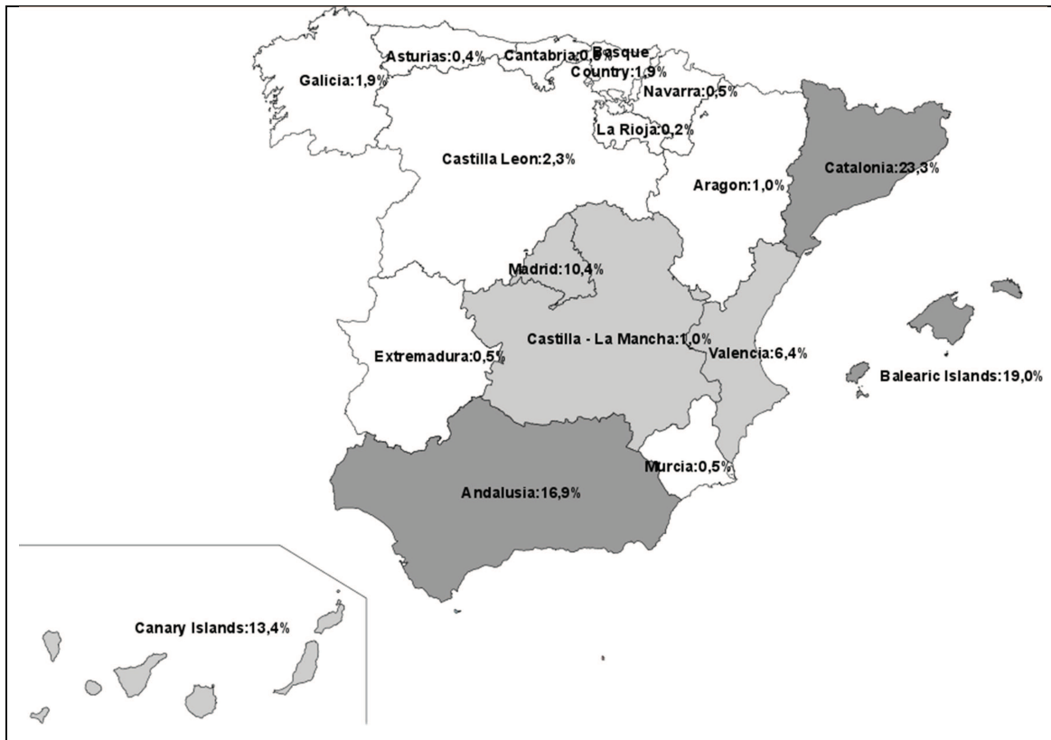
Fig. 1 Frequency distribution of tourist arrivals to Spain by region (mean from 1999:01 to 2014:03)

Tang and Abosedra (2015), Pérez-Rodríguez et al. (2015) and Chou (2013) have shown the important role of tourism in economic growth. In this study we use data on international tourism demand to all regions of Spain provided by the Spanish Statistical Office (National Statistics Institute – INE – www.ine.es ). Data include the monthly number of tourist arrivals at a regional level over the time period 1999:01 to 2014:03. A MIMO approach to regional economic modelling is particularly appropriate when the desired outputs are connected (Claveria et al., 2015). In Fig. 1 we present the frequency distribution of tourist arrivals by region during the sample period. We can see that most tourist arrivals are concentrated in the Mediterranean coast and the islands, being Catalonia, the Balearic Islands and Andalusia the regions that received the higher number of tourist arrivals, which almost amounted to 60% of total tourist demand.