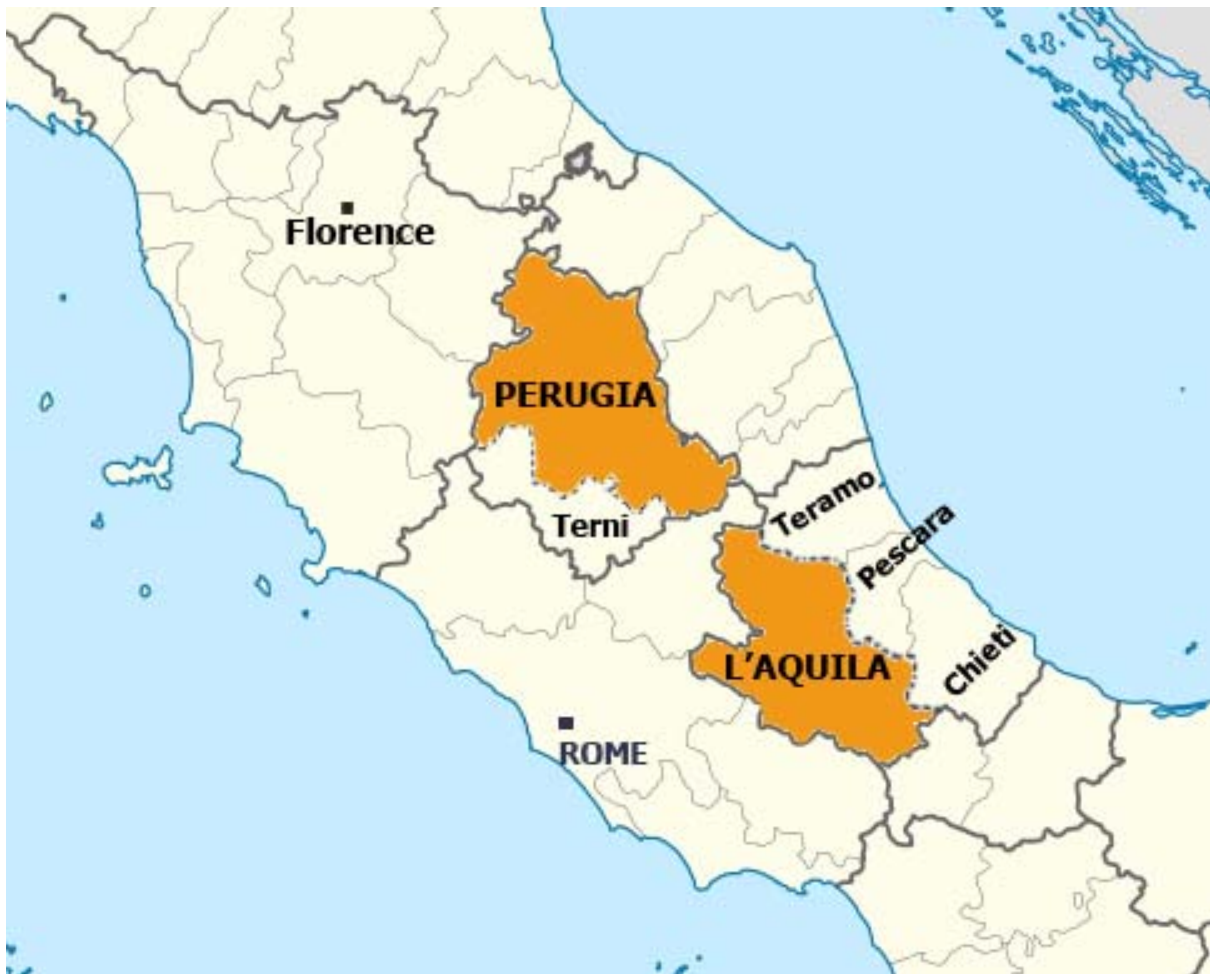
Figure 1: Central Italy -provinces of Perugia and L'Aquila