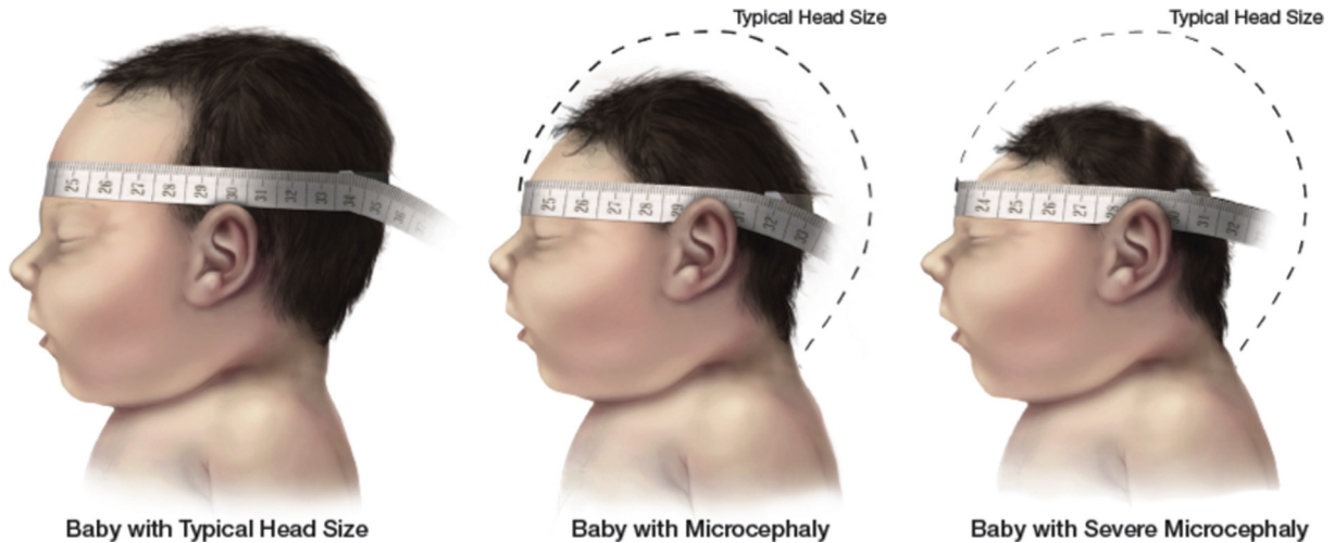
Fig. 1. Measuring Head Circumference (image reproduced from reference CDC's response to Zika [56]).