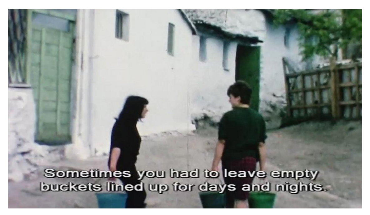
Figure 1. Archive footage used in the documentary Barraques: la ciutat oblidada .

Thorough documentary research is, therefore, vital if we want to ensure that images serve as a testimony to truth and not as a servant to untruth. In this regard, the FIAT/IFTA Archive Achievement Awards recognize the true worth of audiovisual research. An excellent example of such work is provided by Barraques: la ciutat oblidada (Shanties: the forgotten city) , a documentary produced by Televisió de Catalunya, the public broadcasting network of Catalonia, about the urban phenomenon of shanty dwellings in 20th-century Barcelona (Figure 1).