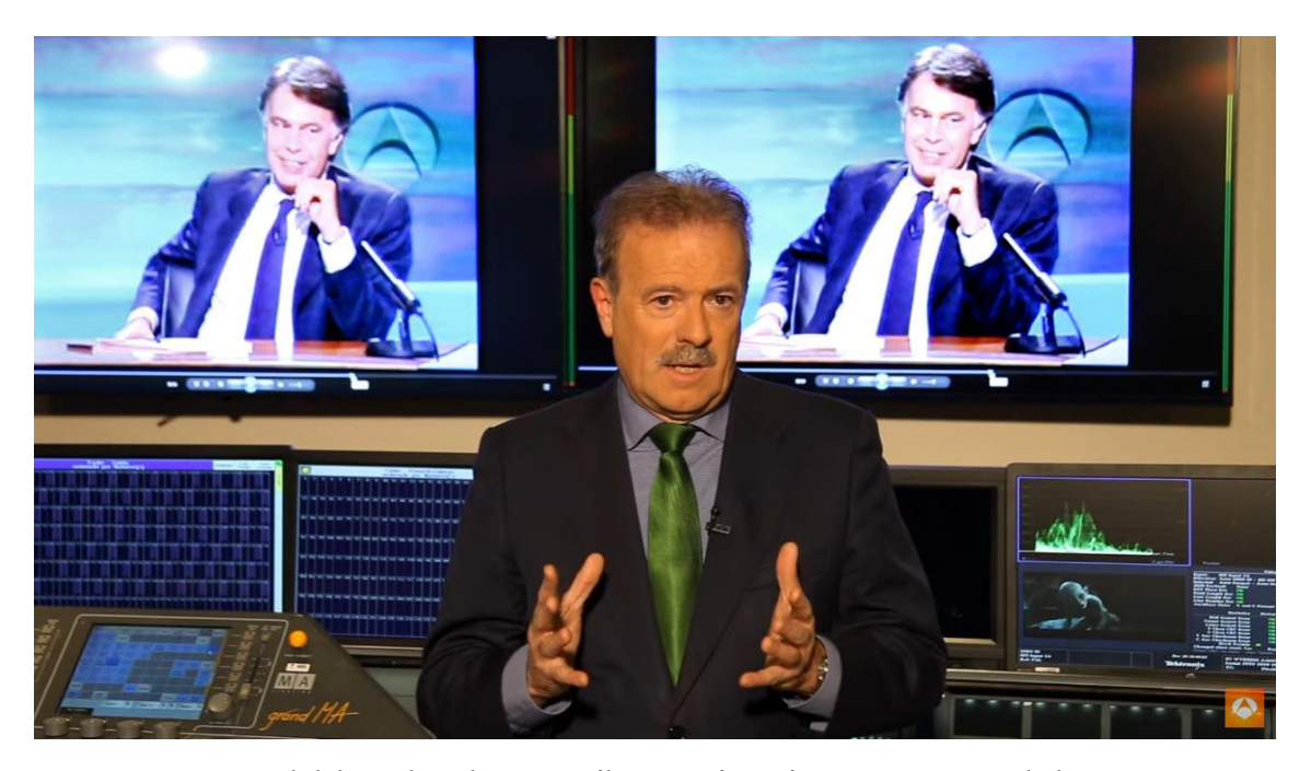
Figure 7. «El debate de Felipe González y José María Aznar: 25 años de historia».

A paradigmatic example of the institutional value of video footage is the face-to-face electoral debate between Spanish party leaders, Felipe González and José María Aznar, just prior to the Spanish general election in 1993 (Figure 7). In addition to its obvious historical value, this was the first televised debate of its kind in Spain, making it also valuable for the history of the media company itself. After all, footage illustrating an institution's major milestones is often used to highlight its authority or importance in its domain.