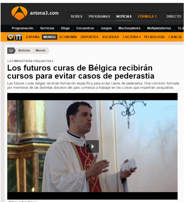
Figure 10. Shot of an identifiable priest, first used on a story about job satisfaction, later reused in a different story about pederasty.

A further illustrative example is shown in Figure 11. The picture next to the headline («New York's public internet faces two problems: beggars and porn») unfortunately has negative implications for the man portrayed in it: he may be assumed either to be a beggar or to be a consumer of pornography, or indeed both, when none of the situations might be correct. Attention should also be paid to the fact that choosing a black person in such a negative context is also perpetuating a racial stereotype.