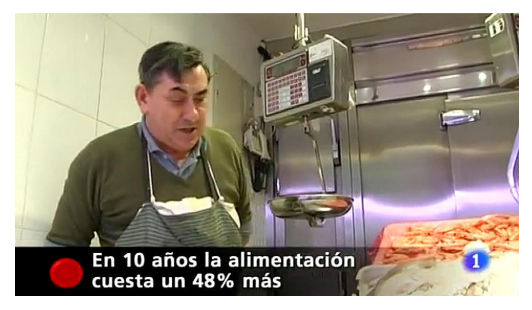
Figure 5. «Algunos las prefieren rubias».

among other events that have occurred during the euro era. Taken together, such footage offers interesting insights and enables us to chart the changing face of our society.