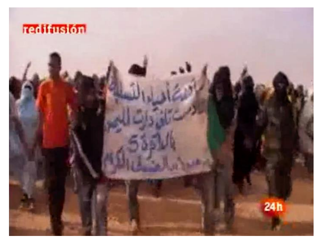
Figure 2. Footage used in the news story «La intifada saharaui».

A good example of the use of such information sources is provided by a weekly news program, Informe semanal (Weekly report) , on Televisión Española , Spain's national stateowned, public-service television broadcaster. Following the ban placed on the world's media by the Moroccan government in 2010 from entering the city of Laayoune to report on clashes, the news story La intifada saharaui (The Sahrawi Intifada) included videos uploaded to YouTube by activists of the Thawra association that denounced the plight of the Sahrawi people (Hidalgo & López, 2014) (Figure 2).