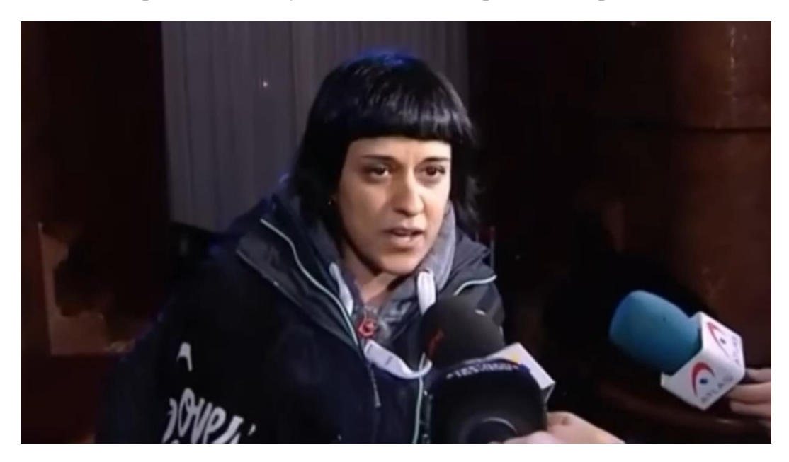
Figure 13. Anna Gabriel giving statements to several media outlets.

Preserving the original speed of the footage is also essential, given that altering the speed can affect the sound quality and the viewers' perception of the speakers. In January 2016, the Spanish news program Antena 3 Noticias allegedly manipulated the speed of a video clip of politician Anna Gabriel, making her voice sound shaky and insecure as she justified a trip to Venezuela with members of the political party Podemos (Figure 13). This distortion, whether intentional or not, was seen as an attempt to discredit her and sway public opinion. Therefore, changing the speed of archive footage can misrepresent the personalities depicted and may have ethical and political implications.