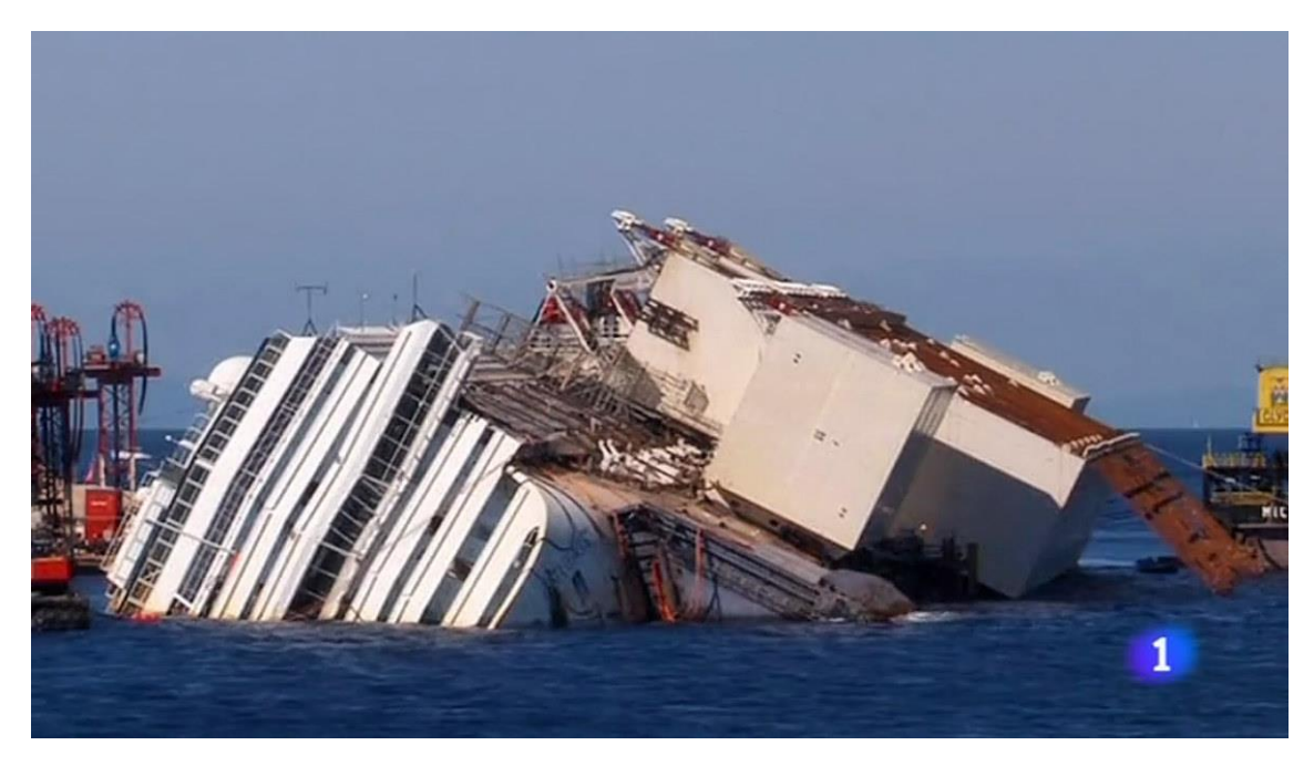
Figure 8. «Condenan a Schettino a 16 años de cárcel por el naufragio del Costa Concordia».

A good case in point is the coverage of the Costa Concordia disaster, which was not a simple one-off event, but rather the beginning of a recurring set of related events. After the cruise ship capsized and sank, the story regained international attention on two further occasions: first, twenty months after the disaster, when the refloating operation was begun; and, second, three years later, when the captain was sentenced. Every breaking story reused footage from previous pieces (Figure 8).