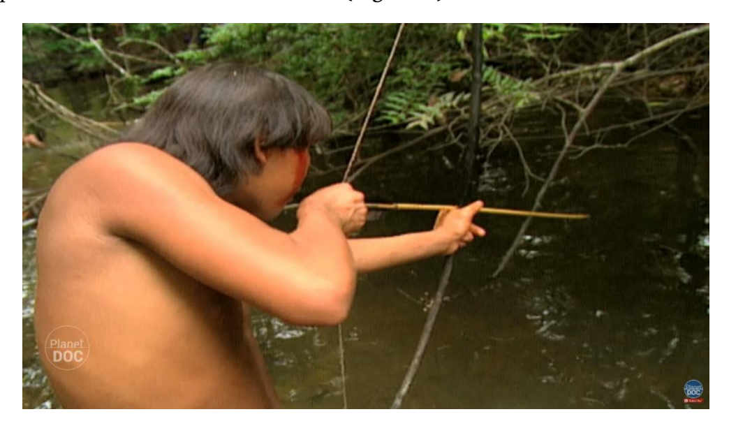
Figure 6. «Isolated Amazon tribe: Yanomami».

Video footage can also illustrate the development of cultures, highlighting the similarities and differences between them. Although purists might claim that the presence of a camera contaminates a scene, a video recording of a cowbell tuner, a transhumant cattle herder or a Yanomami indigenous group portrays something that is indelibly true, and it is of unquestionable value as a document (Figure 6).