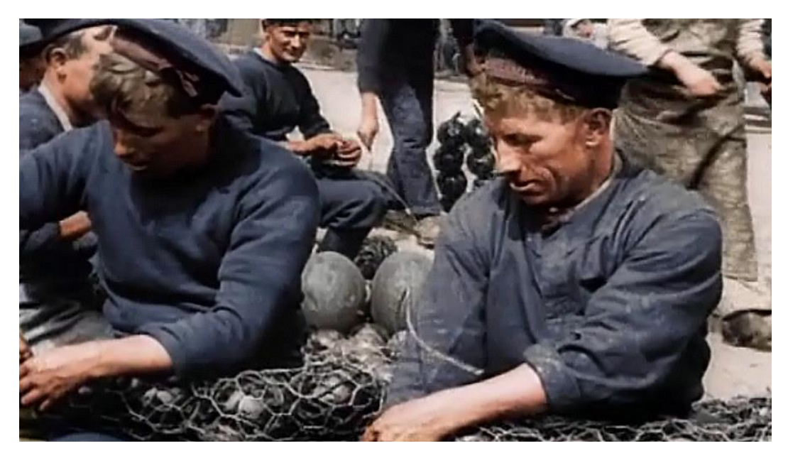
Figure 12. World War 1 in Colour (2003). Footage «recast in colour [...] to tell the story of the First World War as it was seen by those who fought it».

Preserving the original speed of the footage is also essential, given that altering the speed can affect the sound quality and the viewers' perception of the speakers. In January 2016, the Spanish news program Antena 3 Noticias allegedly manipulated the speed of a video clip of politician Anna Gabriel, making her voice sound shaky and insecure as she justified a trip to Venezuela with members of the political party Podemos (Figure 13). This distortion, whether intentional or not, was seen as an attempt to discredit her and sway public opinion. Therefore, changing the speed of archive footage can misrepresent the personalities depicted and may have ethical and political implications.