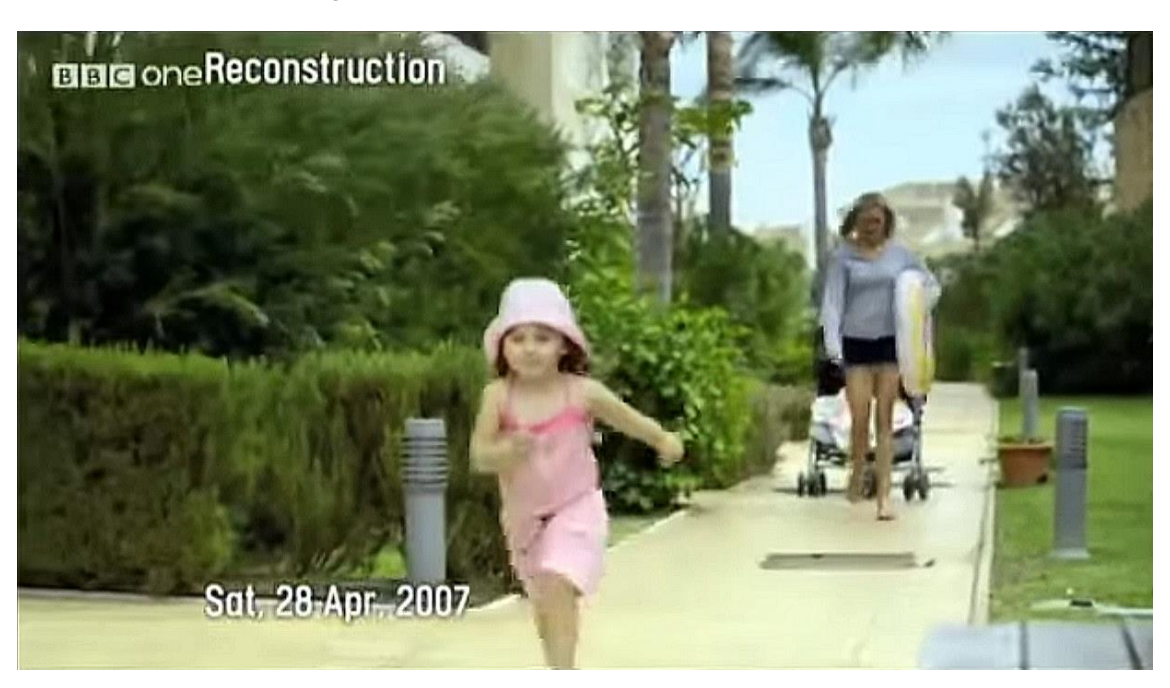
Figure 9. Reconstruction of the disappearance of Madeleine McCann.

Fictional footage or the reconstruction of events can be used in documentaries because of lack of actual footage or to visually enrich the production, but it should not be presented as actual footage. Instead, its origin must be clearly stated both on screen and in the archive database (Figure 9).