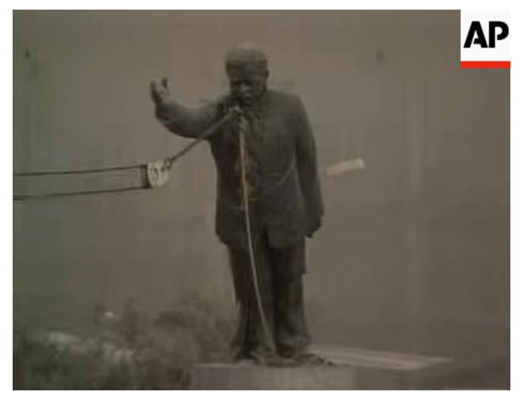
Figure 4. Broadcast of the destruction of the statue of Saddam Hussein.

of bronze. The scene broadcast live worldwide became an icon of the war, a symbol of final victory over Saddam Hussein» (Figure 4).