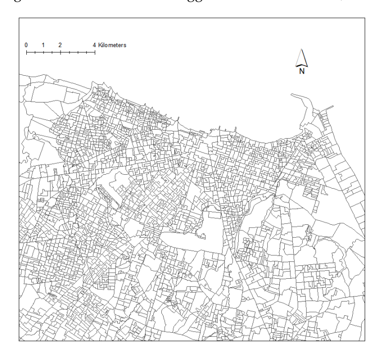
Figure A.2: Detail of urban agglomeration: Fortaleza, 2010