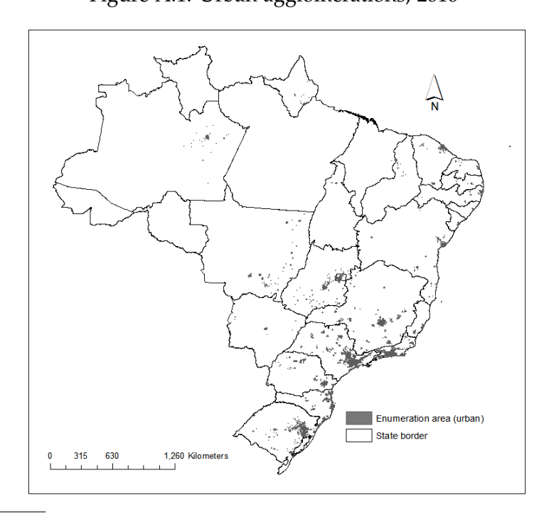
Figure A.1: Urban agglomerations, 2010

The Brazilian Institute of Geography and Statistics (IBGE) freely distributes the Census microdata, which can be found at <a href="ftp:/ftp.ibge.gov.br/Censos/">ftp://ftp.ibge.gov.br/Censos/</a>. It also distributes the digital networks containing the boundaries of the enumeration areas for 2000 and 2010. The original digital networks can be found at <a href="ftp://geoftp.ibge.gov.br/malhas_digitais/">ftp://geoftp.ibge.gov.br/malhas_digitais/</a>. We transformed them to SIRGAS 2000 projected data (UTM South hemisphere zone 24 projection). The geoprocessing was done in the R statistical environment (R Core Team, 2015) using the <a href="maptools">maptools</a>, <a href="maptools">sp, rgdal</a>, <a href="rgeos">rgeos</a> and <a href="maptools">cleangeo</a> packages. Figures A.1 and A.2 illustrate the geographical coverage and layout.