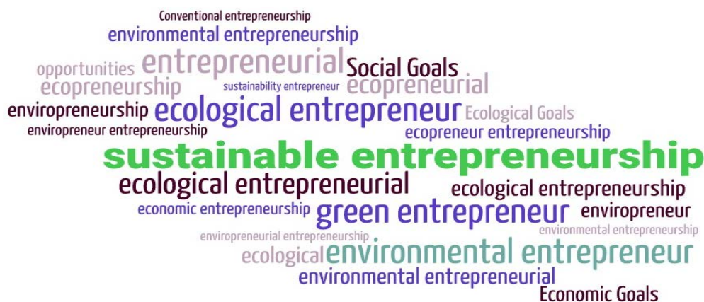
Figure 1: Keywords of sustainable entrepreneurship research field

To conduct the search for literature on sustainable entrepreneurship, indexed in WoS-SSCI database, keywords were identified to allow retrieving related articles. The search for keywords is a useful procedure to ensure the objectivity and replicability of the process of recollection and localization of documents for bibliographic reviews. Initially, the WoS-SSCI list of subject terms (thesaurus) was consulted in order to identify synonyms related to the research. Titles, summaries, keywords and quotations [11, 17] [26-29], among others, were also consulted. 50 keywords that can be used as research terms were listed by using these procedures (including variations such as plural, singular and others) [43, 44]. Among these words are: sustainable: "sustainable entrepreneurship" (or "sustainability entrepreneurship"), "sustainable entrepreneurial opportunity/ies, "sustainable opportunity (or "sustainable opportunities"), among others, such as, "ecological sustainability entrepreneurship"- "green", "sustainable", "ecological", "environmental", "entrepreneur*" (including entrepreneur, entrepreneurial, entrepreneurship), "ecopreneur*" (ecopreneur, ecopreneurial, ecopreneurship), "enviropreneur*" "social/environmental/economic entrepreneurship", (enviropreneur, enviropreneurial, enviropreneurship)-"Conventional entrepreneurship", "Economic Goals; Social Goals; Ecological Goals" among others.