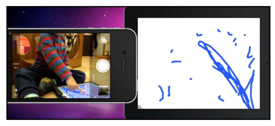
Fig. 1. Screenshot from the computer. The child's action is seen on the left, while the screen of the app "Dessine Moi (Akrio)" on the right shows the simultaneous results of the child's actions.