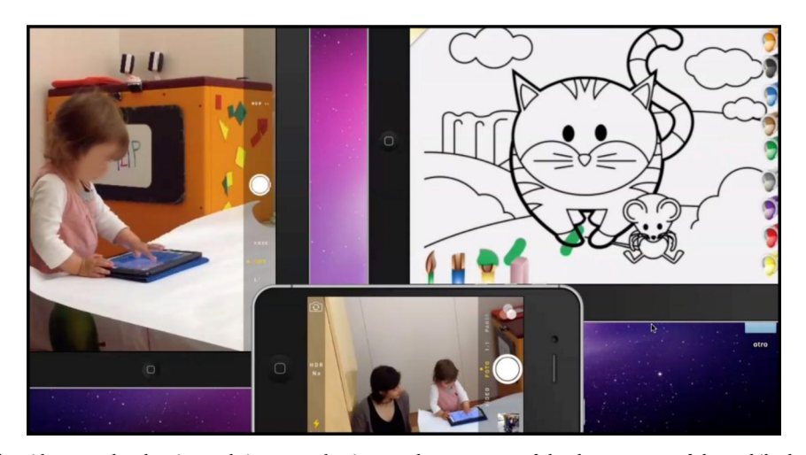
Fig. 3. Screenshot of the video recorder showing real-time reproduction, on the computer, of the three screens of the mobile devices used in the study.