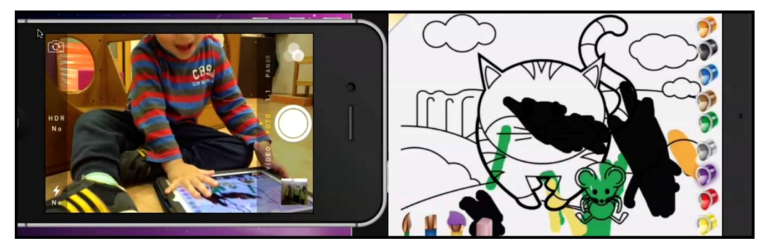
Fig. 2. Screenshot from the computer. On the left a child is shown coloring and on the right the screen of the app "Coloring Zoo (RR)" shows what the child is completing at the same moment.