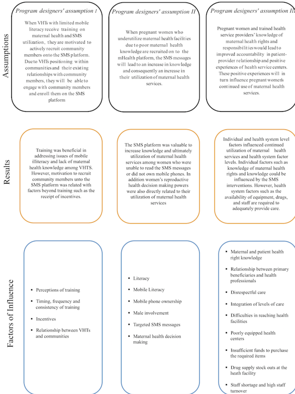
Figure 2. Revised theory of change. SMS: short message service; VHTs: village health teams.

In the program designers' first assumption, VHTs by virtue of the training received and their position in the communities would be able to recruit primary beneficiaries onto the SMS platform. Our results highlight that the relationship between VHTs and community members is influenced by various factors. This