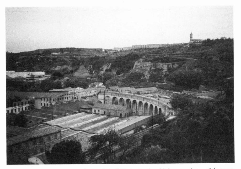
The «colònia Sedó» is a textile suburb built in 1878, beside river Llobregat and near of the towns of Esparraguera and Olesa de Montserrat; is still inhabited. The factory was built between 1847 and 1850, and until the end of the 1980 decade was working.

The industrial revolution initiated the enlargement of different sectors of the Catalan industry, which was at the beginning restricted only to the cotton industry. Within the same textile sector, the development of the wool sector also took place, which concentrated basically in the cities of Sabadell and Terrassa. In 1832 the first mechanic loom for wool weaving was installed in Sabadell and in 1838 the first steam engine? Although a basic metallurgy was never developed, there was a considerable increase of transformation metallurgy, which devoted mainly to the production of textile machinery. Some of the old activities, such as paper manufactures and cork industry, attained a completely industrial character.