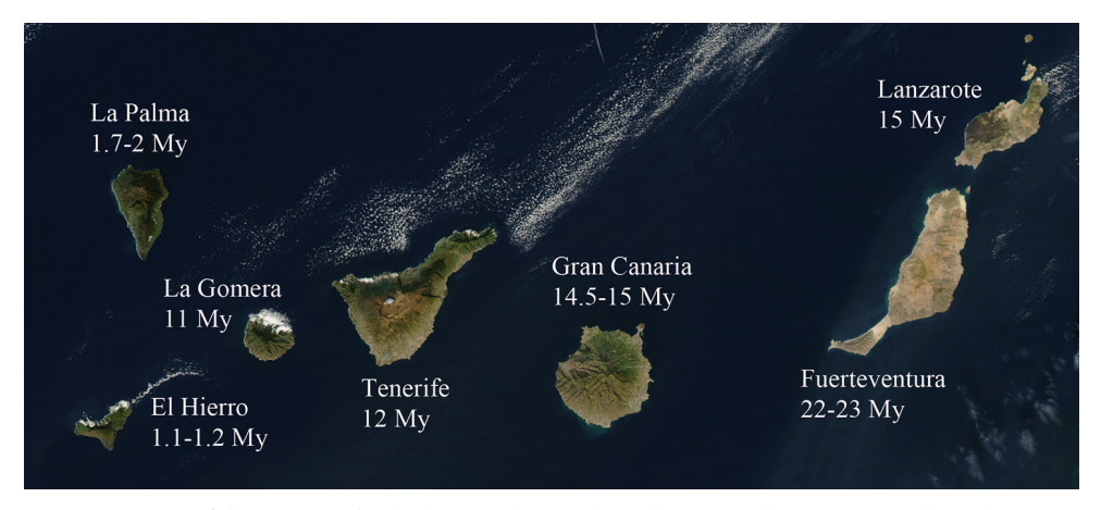
Figure 1. Map of the Canary Islands showing their geological age according to Carracedo et al., (1998) and van den Bogaard (2013).

single island endemics, but a few are present in two or three islands. The synanthropic D. crocata Koch, 1839 has also been reported on most of the islands.