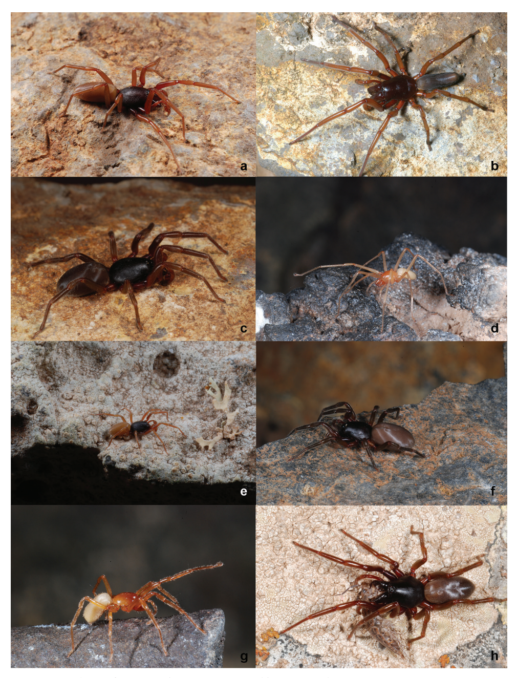
Figure 2. Habitus of some Dysdera species: a D. calderensis b D. longa c D. verneaui d D. unguimmanis e D. minutissima f D. arabisenen g D. sibyllina h D. silvatica.