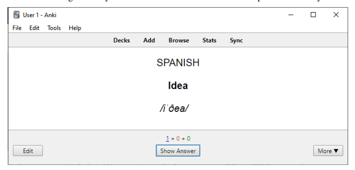
Figure 9. Side A of the cognate Anki Flashcard.

For each activity there are different resources and tools that have been designed as well. On the following section you can see the material created for the previous activity.