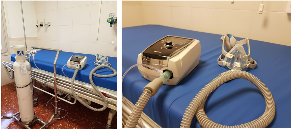
Figure 1. Photograph of the noninvasive ventilation system used in the study with an orofacial mask connected to an oxygen tank by a T-piece adapter at the proximal end of the tubing.

neoplastic disease treated with chemotherapy or accompanied by cachexia in the previous 2 years; concomitant diagnosis of COPD or asthma or spirometry with forced expiratory volume in 1 s ( FEV_1 )/forced vital capacity (FVC) < 0.70 ; prior hospitalization for acute worsening of their lung condition in the last 12 weeks prior to the onset of the study; and respiratory infection in the 4 weeks prior to the study. All the patients were presented in our multidisciplinary discussion session. All diagnoses were established following standard guidelines. 14–16