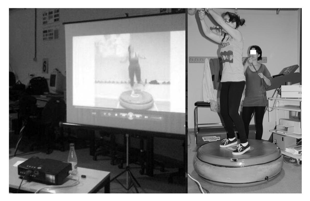
Figure 1. Aerobic dance session performed on an air dissipation platform. The video session was projected on a giant screen individually to each participant.

To verify that both AD classes (ADP vs. hard surface) were rigorously the same, a video of an AD class was recorded a week before. Participants were instructed to imitate the motor tasks to be performed by an expert instructor to the rhythm of the music (Figure 1). Since all participants were familiarized with AD classes, the motor tasks were not difficult to replicate.