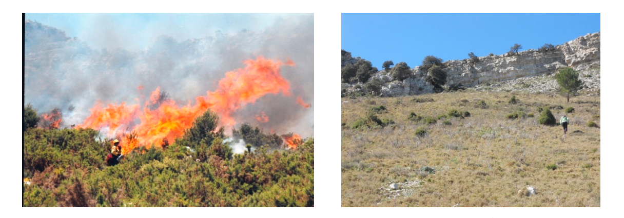
Figure 3. Tivissa plot during the first prescribed fire in 2006 (to the left) and as seen nine years later during the most recent sampling event (to the right).

this study is the same as that described for the Montgrí plot [30], comprising 42 sampling points within a plot, measuring 4 \times 18 m, within the burned area. Figure 3 show the view of the study site in 2006 and 2015. A sampling plot was established within the burned area using a grid structure ( 4 \times 18 m). Soil samples were collected after the prescribed fire at 42 points along three transects and along three lines running perpendicular to the central transect [30].