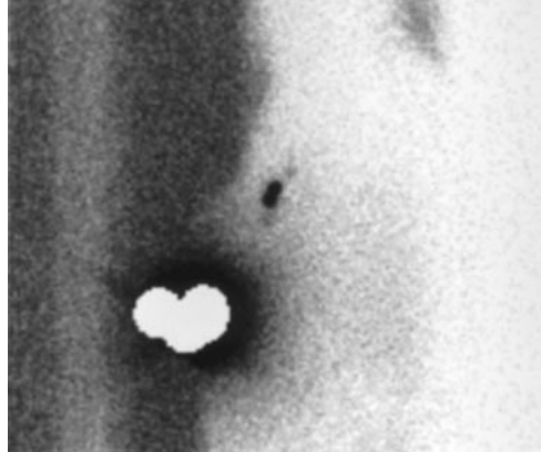
Fig. 2. Anterior (A) and lateral (B) views of a patient, showing drainage to the intramammary chain. Time post-injection, 2 h.