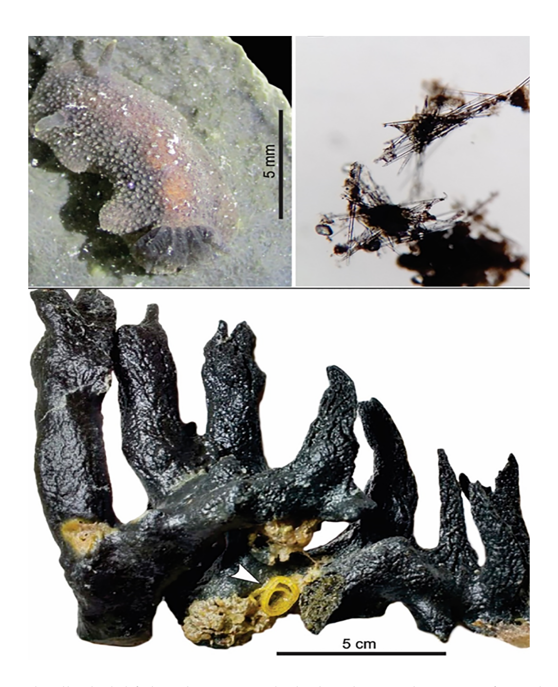
Figure 1. a) The nudibranch D. kyolis feeding on the sponge H. (H.) melanadocia . b) Spicules (oxeas) and tissue remnants of H. (H.) melanadocia found in the feces of D. kyolis . c) The arrow indicates egg ribbons of D. kyolis in the base of the sponge.

and likely specificity for this sponge species in the study area. Despite this, it was not possible to detect extensive damage in the sponge individuals where D. kyolis was found. Only superficial marks were observed in its ectosome.