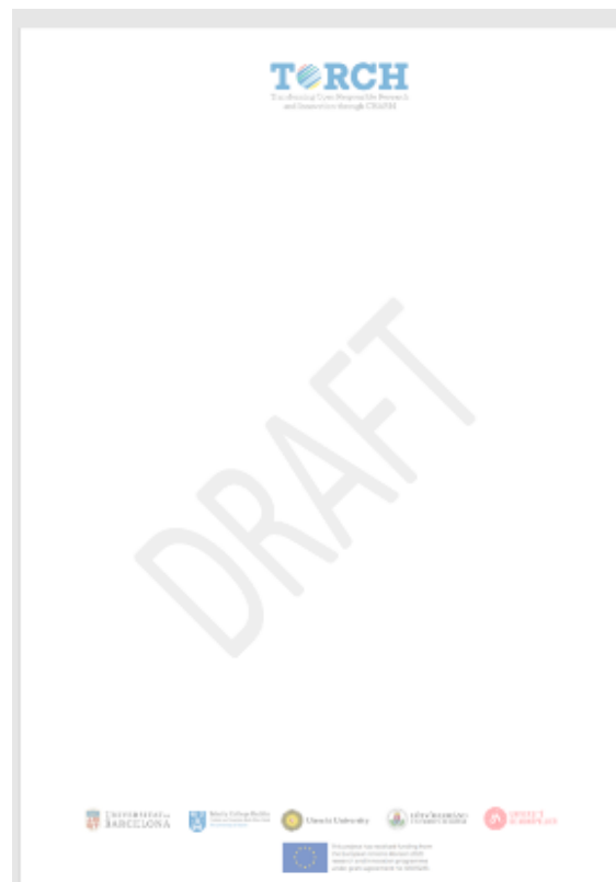
Figure 4. TORCH Stationery Template.

Stationery Template: All the TORCH official documents including press releases, letterheads and official statements will have the following design: