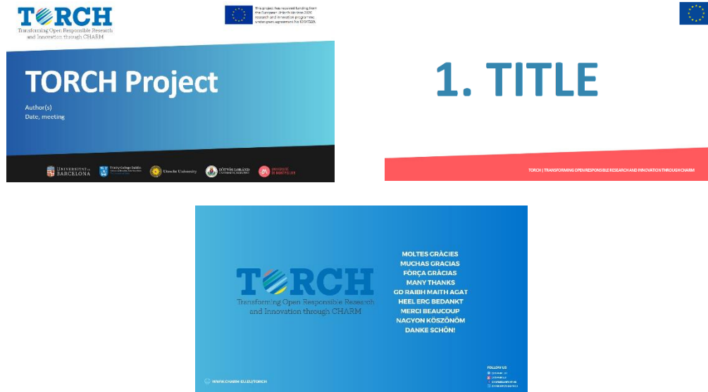
Figure 5. TORCH Power Point template sample.

Power Point template: Presentations play an important role when communicating and dissemination about the project. When presenting on behalf of TORCH, to both internal and external audience, this branded template should be used.