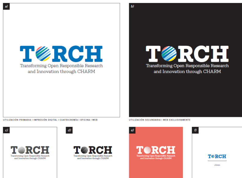
Figure 1. TORCH logo.

A TORCH logo has been created to support the visual identity of the project. The logo includes elements from CHARM-EU logo to keep the two projects related. CHARM-EU colors and typography were used, as well as the stripes of the emblem, reflecting the tradition and the prestige of the five partner universities. The acronym of the project is described for viewers to easily comprehend the objective of the project.