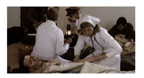
FIGURE 3 Students of master's studies in cultural and heritage management at the University of Barcelona in a film based on historical recreation for a hospital interpretation center during the Battle of the Ebro, during the Spanish Civil War. Frame of the video production of the previous scene (Figure 2).

The aim was to prospect for the didactic possibilities of historical re-enactment from the perspective of teachinglearning. Incorporating historical re-enactment activities into