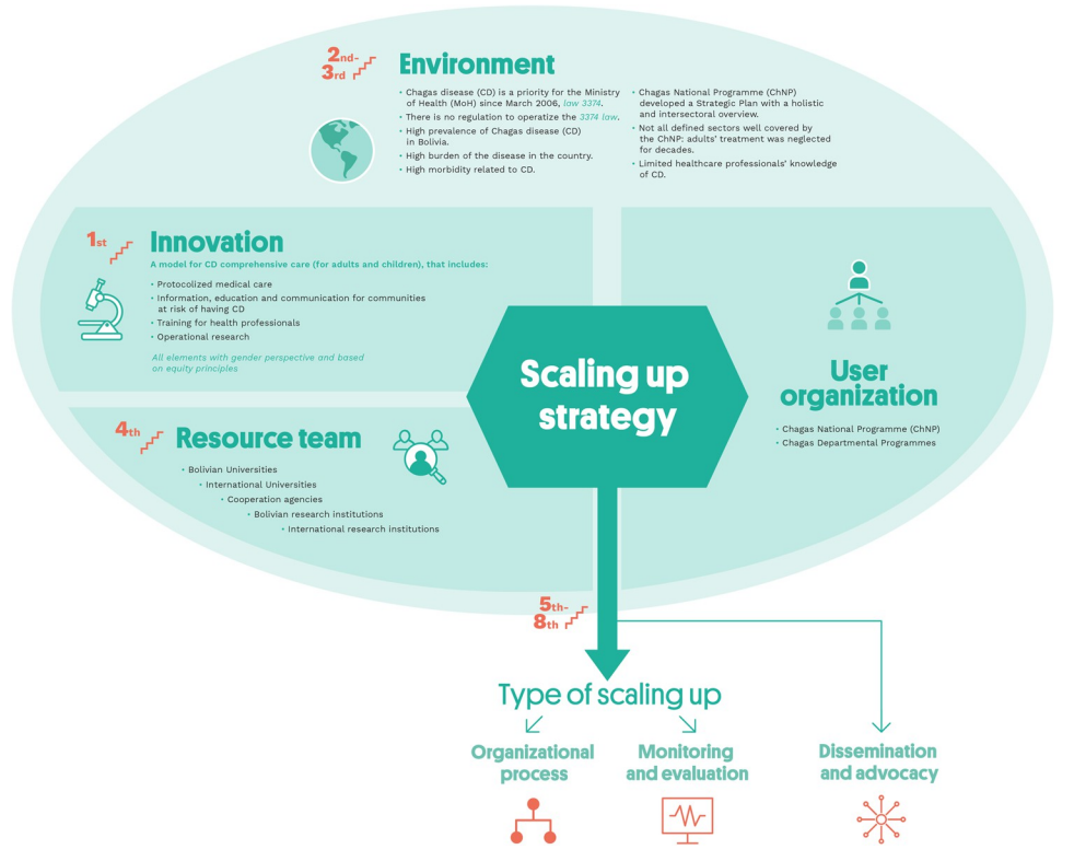
Fig 1. Elements of Chagas Platform at scaling up strategy.

The project intervention area were three CD endemic departments (Cochabamba, Tarija, and Chuquisaca) in Bolivia.