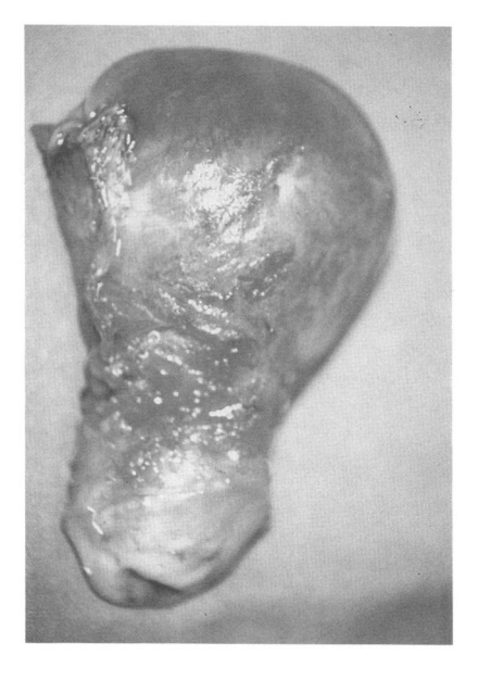
FIG. 4. The uterus with the staples placed along its right side.

Shapiro et al., in a classic study, <sup>18</sup> suggested the risk factors for infection at the operative site after abdominal or vaginal hysterectomy. Logistic-regression analysis indicated that factors significantly associated with a higher risk of infection at the operative site were younger age, being a clinic patient, lack of antibiotic prophylaxis, increased duration of operation, and an abdominal approach. Additionally, a higher risk of infection and a decreasing effect of antibiotic prophylaxis associated with increasing duration of surgery were striking findings in their study at Boston Hospital. <sup>18</sup> Hysterectomy performed with staples