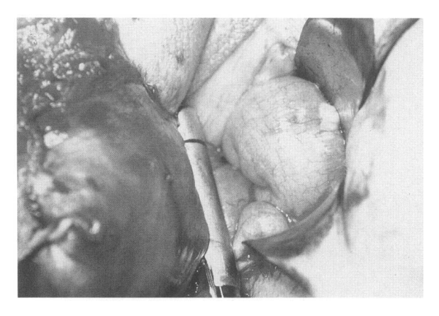
FIG. 2. The instrument embracing the uterosacral and cardinal ligaments on the left side.

Total vaginal hysterectomy is an excellent operation when removal of the uterus is indicated in cases of benign disease. The objective of this study was to assess the safety and feasibility of vaginal hysterectomy using Autosuture staplers. Stapling instruments have been used widely in general surgery, 5-16 but to our