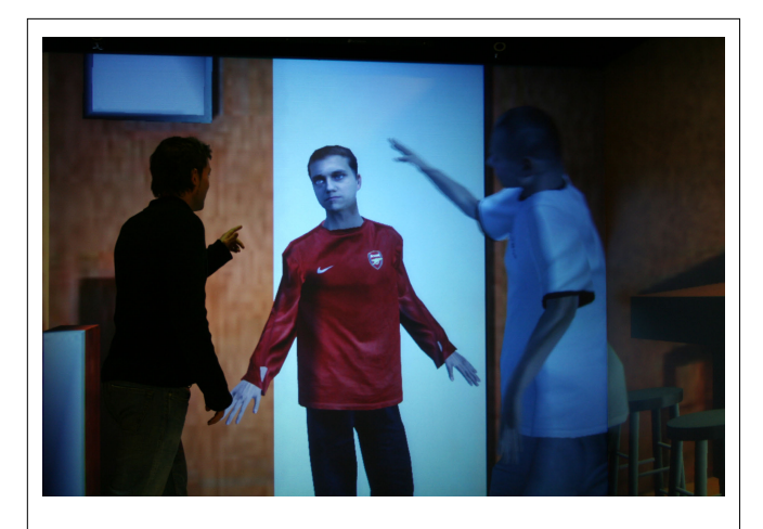
FIGURE 3 |The virtual characters are life-sized and can look the volunteer in the eye. This figure is for illustrative purposes, since the volunteer would normally be wearing the stereo eyeglasses.

Over the 2 min and 20 s of the scenario the assault by P(erpetrator) becomes increasingly threatening, in language (with significant shouting and swearing), and aggressive gestures ( Figure 2C ), until finally the perpetrator begins to violently push V(ictim) against the wall ( Figure 2D ). In terms of body size, gestures and also voice tone, the overall demeanour of P is threatening and aggressive, and that of V is submissive and wanting to avoid trouble. However, whatever answer is given by V, P uses this to escalate the argument to a more dangerous level. It is important to note that from the point of view of the volunteer the virtual characters are life-sized ( Figure 3 ), displayed in 3D stereo, with movements based on motion capture from real people, and voices that are recordings from actors. Since the volunteers are head-tracked the characters can be programmed to look them in the eye.