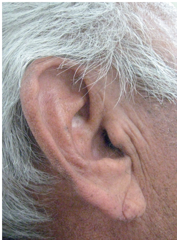
Fig. 2. The same patient with a somewhat less distinct diagonal ear lobe crease on the right side.