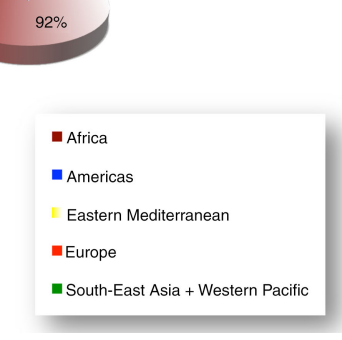
Fig. 1. Endemic geographical distribution of some human parasitic diseases. The map shows 5 different areas of the world according to WHO: Americas, Africa, Europe, Eastern Mediterranean and South-East Asia Western Pacific. The percentages represent the distribution of autochthonous endemic cases (133).

isolated from plasma of mice and from reticulocyte culture by differential centrifugation and their identity was confirmed by electron microscopy, FACS and proteomic analyses. The study demonstrated that exosomes derived from infected reticulocytes contained host and parasite proteins and had a role in modulating immune responses (30). Parasite proteins within the exosomes included several antigens such as merozoite surface proteins 1 and 9, as well as blood stage surface antigens and enzymes related to proteolysis and metabolic processes. Immunizations of BALB/c mice with exosomes from infections, isolated both from peripheral blood and from reticulocyte in vitro cultures, elicited IgG antibodies capable of recognizing P. yoelii-infected red blood cells (iRBCs), induced reticulocytosis and changed the cell tropism to reticulocytes of the normocyte-prone lethal P. yoelii 17XL strain upon infection. Moreover, when combined with CpGoligodeoxynucleotides, immunizations conferred complete and long-lasting protection against lethal infections in close to 85% of the mice tested. These data thus showed for the first time that exosomes derived from reticulocytes could be explored as a vaccine and platform against malaria infections (30).