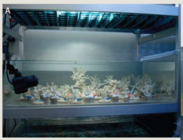
Figure 1. (A) Aquaria containing the cold-water corals Madrepora oculata and Lophelia pertusa , as part of the new autonomous system developed by ZAE (Instituto de Ciencias del Mar (CSIC), Barcelona). (B) Aquarium with corals Desmophyllum cristagalli (left) and Dendrophyllia cornigera (center).

The water in each aquarium is recirculated through the submerged pumps (RP), which homogenize the water masses and generate currents—essential for the corals. To avoid overflow, each aquarium is equipped with an outlet to expel the excess water to TA2 when it exceeds the maximum level. In the same way, TA2 is provided with an outlet to eject excess water, as well as an electric pump (P2), which discharges the surplus water to TA1 after passing through a biological filter that eliminates suspended particles.