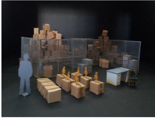
Fig. 12. Unicorn Theatre production of Dr. Korczak's Example . Designer: James Button (Teacher Resource Pack 2012: 14)