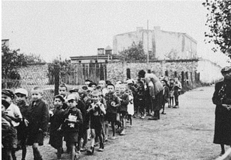
Figs.5, 6. Adults and children being deported from the Warsaw ghetto (Unicorn Theatre 2012: 8).

On its part, TAG, the company that commissioned Dr. Korczak's Example , explores three main themes from the play in its "Teachers' Resource Pack": "resistance to oppression, community and the individual, and children's rights" (2001: 1). It includes a detailed account of how role-play games or drama exercises, such as "interviewing the past" (2001: 2) or "blue eyes brown eyes" (2001: 7), a game on power relations, can be used in class, using image cards and other techniques. Text analysis plays an important role in the pack, creating a space for reflection on and interpretation of the play by children, asking questions: "How would you feel about having a court in your school?", or "In the light of the historical period, how realistic were Dr. Korczak's beliefs in the rights his children should have?" (2001: 9). Each of the information and resource packs is based on in-depth research into the topic and explores theatre as a tool for social transformation through the education of children and youth. They thus contribute to modeling emancipated spectators, critical subjects, and active citizens.