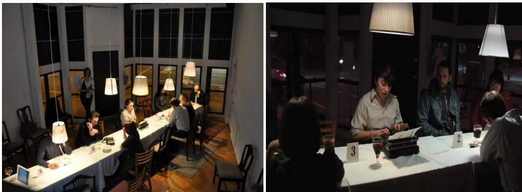
Fig. 8. Rooms Productions’ Seven Jewish Children in Chicago in March 2009, directed by Andrew Manley; the scenes were performed simultaneously, allowing the audience to circulate among the actors.

The play is shaped as a poem, each of its seven parts containing no indication as to whom each line belongs to. The form of Seven Jewish Children and its “lack of stage directions, identified speakers, and even plot forces us to find its dramatic meaning elsewhere: in the interaction between the script (given different shape in each production by actors and directors) and spectators (made to perform, too, as they generate meaning)” (Gobert 2014: 166). By allowing spectators to step inside the performance, the production of Seven Jewish Children by Rooms Productions in Chicago in March 2009 stressed the spectators’ active, emancipated involvement with the play (Fig. 8).