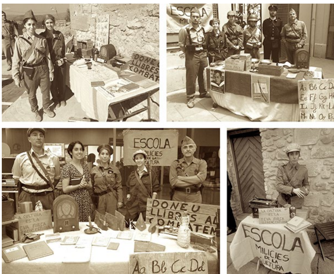
Figure 4. Recreation of the militias of culture, in a commemorative event, 2017.

carried out was the Spanish Civil War, and obviously, a war cannot be studied outside of its military component. However, it is no less true that a war cannot be understood, considering only the military variables. The re-enactment activities that typified the service-learning experience incorporated elements of war, but also non-war variables. Thus, the re-enactment activities emphasized different presentations, in which visitors could partially contemplate or experience realities that made up a civil perspective on the war. During war times, there are men and women doing activities to support and to be with other people so much as to maintain life and health. Enhancing human solidarity even in these difficult circumstances shows the other face of war. The DIDPATRI group had considerable experience in this field. It had developed museographic projects on the heritage of the conflict that gave relevance, precisely, to the civil dimension, following the example of proposals such as Peronne's «Historial de la Grande Guerre»; or «Flanders Field» by Ieper. (Feliu, 2011; Íñiguez-Gracia & Hernández-Cardona, 2004; Muchitsch, 2014).