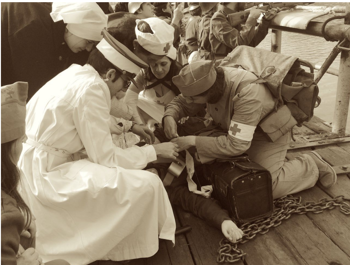
Figure 5. Reenactment of war healing. Collaboration of DIDPATRI with the groups «Ejército del Ebro» and «XV Brigada Mixta».

There were also small re-enactment exhibitors on food, passive defence, the prevention of chemical warfare, the organization of public schools (a movement called «Consell de l'Escola Nova Unificada CENU»), on the role of women in war etc. Naturally all re-enactment activities also had a military dimension: recruiting offices, training, description of weapons and equipment. To include real these actions in exhibitions, transform the understanding of historical events in a more human way.