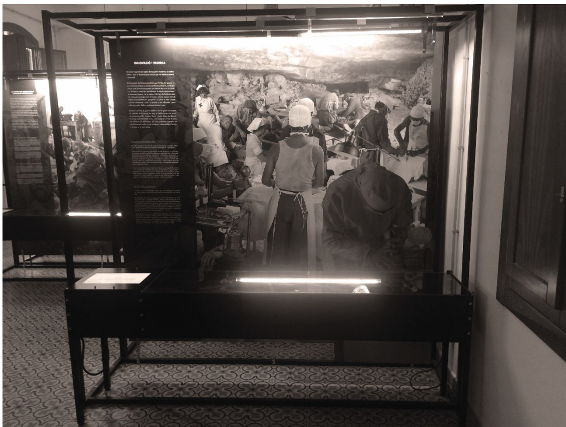
Figure 8. Museography of the Hospital del Molar (Tarragona), in collaboration with the recreation group «Ejército del Ebro», 2018.

Finally, it should be noted that recreation was also used preferentially in some museographic proposals. The most important was developed at the «Centre d'Interpretació de l'Hospital del Molar». The Molar museographic proposal (Tarragona) was implemented in the management building of an old mine that, during the Battle of the Ebro, became a field hospital for the Republican army. In preparing the museographic proposal, re-enactors were used to get video images of field hospitals, surgical operations (following the «Trueta» method), and the organization of the republican health system during the battle. The images were also used extensively in the graphic production of the exhibition. The iconography generated from the recreation, adjusted from the matte painting treatment, played a decisive role and the centre became a pioneering experience of a museographic space structured by images from historical recreation activities. (Sospedra et al., 2020).