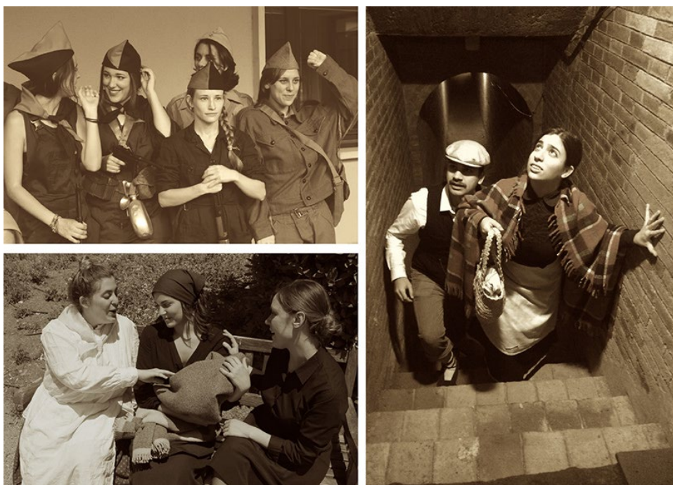
Figure 1. Re-enactment practices in the Master of Heritage Management and Museology at the University of Barcelona (2015).

In this sense, the design of re-enactment activities carried out by university students could be of great help in actions to recover and dignify the memory of the Spanish Civil War that was carried out in museums, monuments or archaeological sites. The students mainly belonged the Master's degree in Heritage Management and Museology, and the Primary Teacher Degree from the Faculty of Education, although students from various specialities from the Faculty of Geography and History.