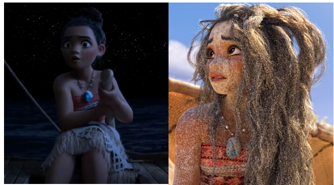
From Moana (2016)

In the first place, princesses' hairstyles have evolved with every film: from presenting the stiff hairstyle of Snow White which does not suffer any change in the whole movie to giving a more realistic approach to Moana's hair which gets wet, gets dirty with sand, which bothers her sometimes and makes a bun with it. In fact, many times their hairstyles can reflect their place in society as well as representing social oppression. Hair is quite important when identifying the princesses as part of the royalty or not. For example, we see how Snow White, Aurora, Ariel, Jasmine or Pocahontas do not quite change their hairstyle since they hold the title of princess throughout