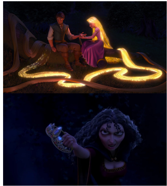
From Tangled (2010)

Gothel's is pure dark and Rapunzel is blonde, apart from the fact that when Rapunzel's powers are taking action, her hair shines brightly. However, when we reach the end of the movie, we experience the liberation of Rapunzel from her hair: contrary to the original tale in which Gothel cuts Rapunzel's hair as punishment, in Tangled it is Flynn who cuts her hair in a more liberating moment. Rather than being a punishment or a prohibition to enjoy her hair, Flynn liberates her from all the pressure Rapunzel holds because of the power in her hair. This act also emphasizes the relationship