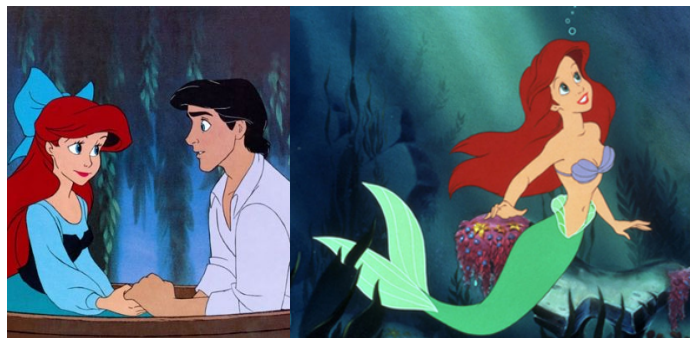
From The Little Mermaid (1989)