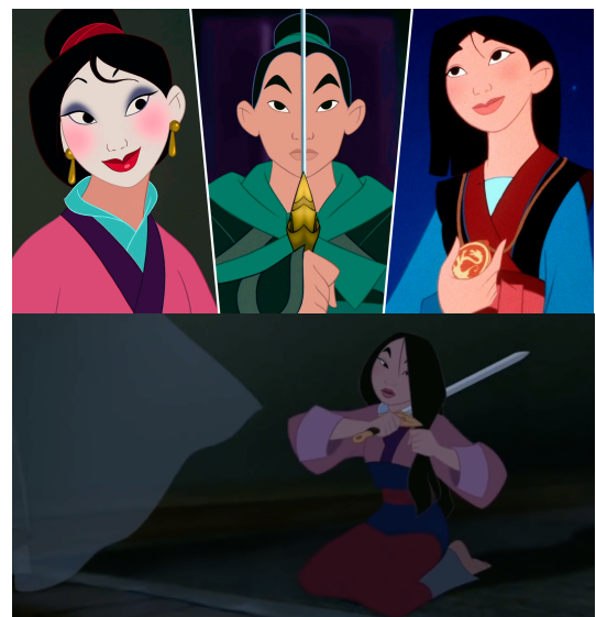
From Mulan (1998)