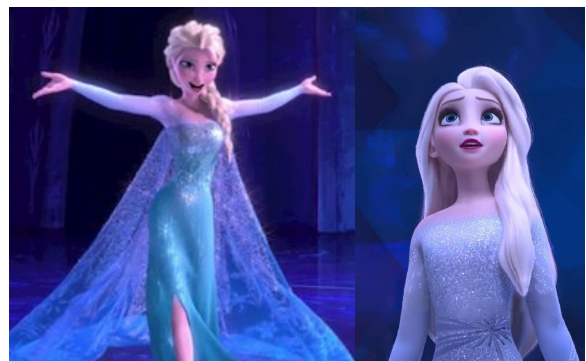
From Frozen (2013) and Frozen II (2019)

her social pressure, also stands for her magic powers: most like Rapunzel, the social pressure she experiences is because of her powers and the fear her society has of them. In these movies, we see once more how some hairstyles show the princesses' status as part of the monarchy: Elsa, Anna, and Iduna (Elsa's and Anna's mother) exhibit exactly the same haircut when they occupy the throne of Arendelle. Likewise, in the first film, when Elsa is rejected by her community, she gets rid of the monarchic haircut during the song "Let It Go" and transforms it into a braid as a symbol of the bursting of her powers. She again changes her hair in Frozen