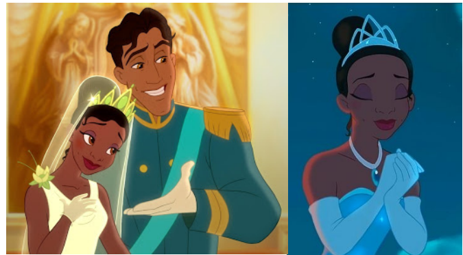
From The Princess and the Frog (2009)

identity. Tiana, on the other hand, presents several hairstyles throughout the film –indeed she is maybe the princess with the most hair changes. However, it is pretty noticeable how, similarly to Cinderella, when she is in a formal environment, she is portrayed with similar haircuts. Even when she dresses up as a princess in Charlotte’s party, she exhibits the same haircut as when getting married to Naveen twice.