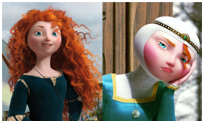
From Brave (2010)

On the other hand, apart from displaying their social status, hairstyles can also work as a symbol of the social oppression some of these princesses suffer. Firstly, the princesses that struggle with social pressure find their hairstyle tied up. In general terms, all the princesses when they hold their position of power in the monarchy