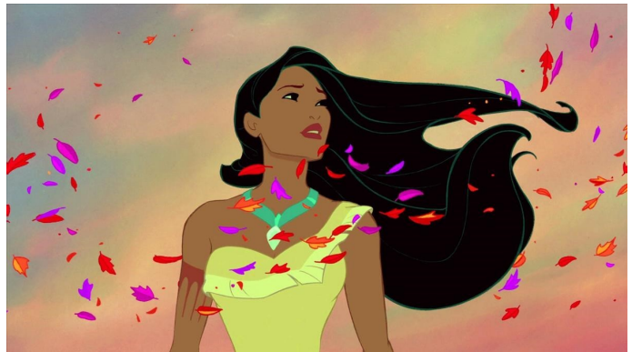
From Pocahontas (1995)

2 in the scene of “Show Yourself,” the epiphanic moment in which Elsa understands her true nature. Even before starting the whole scene, Elsa already liberates herself from any ties in her hair as a proof of her final revelation moment: only when she understands she has to be totally free from any bound with Arendelle is when she also liberates her hair from that and wears it completely free. In this revelation moment, we discover that Elsa is naturally more related to nature since she is the Fifth Spirit and we associate this freedom with nature. In fact, other princesses that are related more with nature, like Pocahontas, Ariel, Merida, and Moana, present free hairstyles, without ties, helping on the association of freedom (represented by the hair with no ties) with nature. As proof of that, if we observe the case of Ariel, we see how in her kingdom, she wears her hair freely while in the upper world with Eric, we observe her with a bow tiding her hair. Even Moana, when she gets a crown symbolizing she has reached the top position in her society, her hair remains without any tie, apart from the fact that her crown is made of plants and flowers, nature motifs.