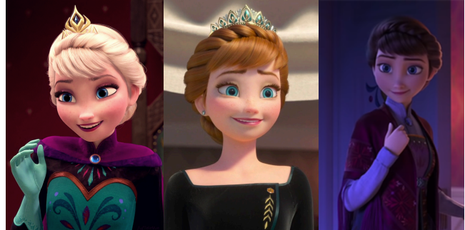
From Frozen (2013) and Frozen II (2019)

In Frozen and Frozen 2 we also experience another princess that deliberately changes her haircut to subvert the social order. Elsa changes her hair twice (one per film) as a symbol of her process of self-esteem and self-acceptance. Elsa's hair, a part of representing