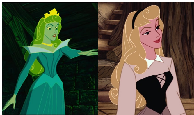
From Sleeping Beauty (1959)

the whole film. Even Aurora and Ariel do not change their hairstyles when they change environments (when Aurora accepts her position as a princess; when Ariel spends three days with Eric in the human world) because, despite being in different places, they remain princesses during the whole film. Jasmine, on her part, only changes her hairstyle when she becomes Jafar's slave; during the rest of the film, she sticks to the same hairstyle. With Jasmine, we get to see how