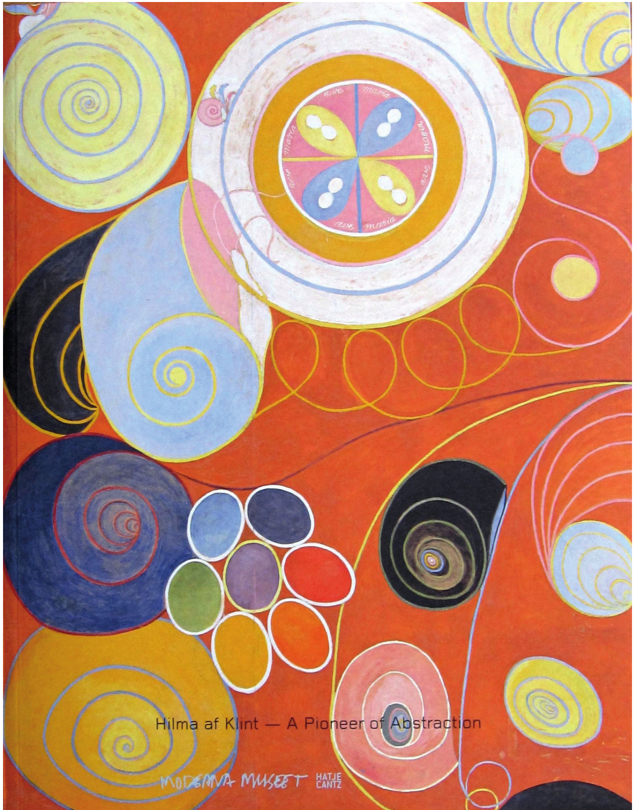
FIGURE 3. COVER OF THE CATALOGUE HILMA AF KLINT: A PIONEER OF ABSTRACTION Moderna Museet, Stockholm, 2013.