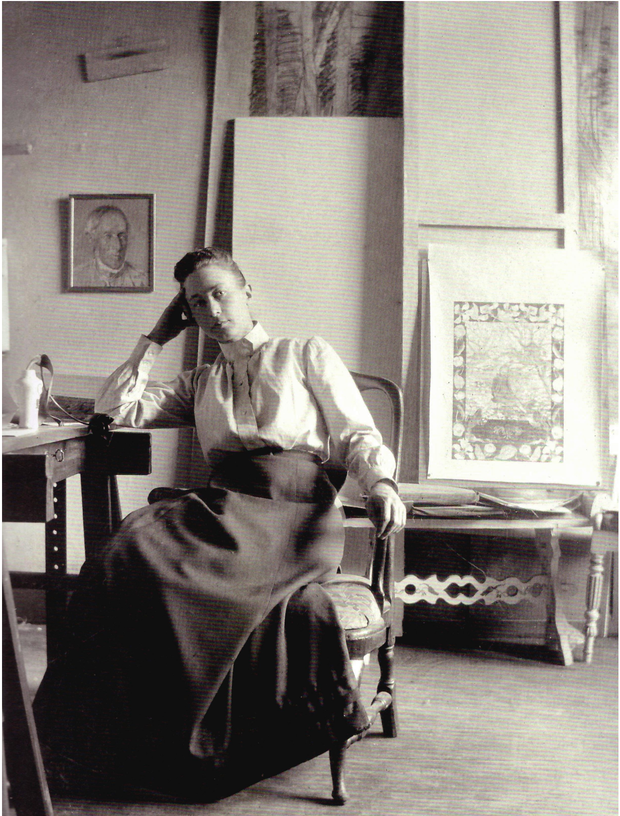
FIGURA 4 HILMA AF KLINT IN HER STUDIO, C. 1895