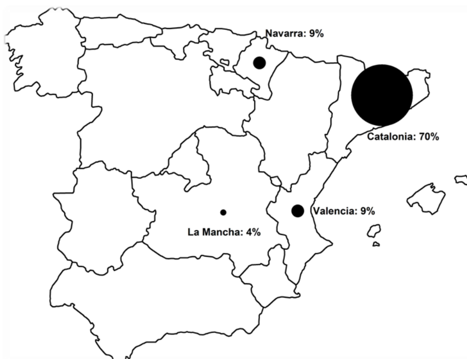
Figure 4. Distribution of wine cooperatives in Spain in the 1930s