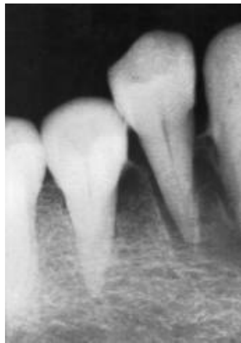
Figures 2 and 3.

Intraoral view and radiographic appearance of involved teeth 3 weeks after the onset of vesicular eruption.