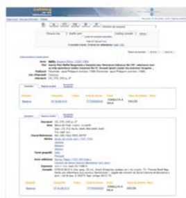
University of Barcelona. Library Catalogue

When considering the limitations of the system used to state these evidences, the Library decided to begin a database of provenances, whose beginning can be situated in February of 2009. Since then, and in what one might consider as a first phase, the working system is the following: in parallel to the cataloguing of our collection, the details of the previous owners, individuals or institutions, are described in the authority file.