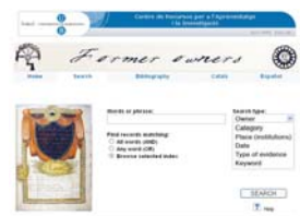
University of Barcelona. Provenance Database