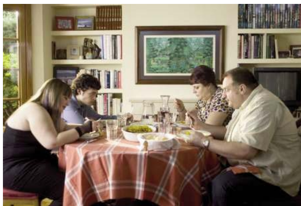
Figure 6: The obese family having lunch.

with him (he gives spoonfuls of cake to his wife), in an act full of apparent affection. However, he confesses that he does this to minimize the guilt he feels about his enormous appetite (Figure 6).