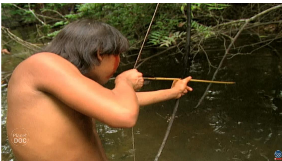
Figure 6. «Isolated Amazon tribe: Yanomami». Source: Planet Doc. https://planetdoc.tv/documentary-yanomami-tribe

Video footage can also illustrate the development of cultures, highlighting the similarities and differences between them. Although purists might claim that the presence of a camera contaminates a scene, a video recording of a cowbell tuner, a transhumant cattle herder or a Yanomami indigenous group portrays something that is indelibly true, and it is of unquestionable value as a document (Figure 6).