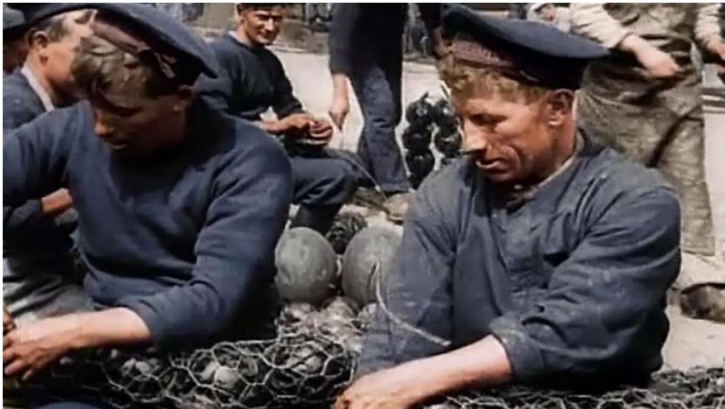
Figure 12. World War 1 in Colour (2003). Footage «recast in colour [...] to tell the story of the First World War as it was seen by those who fought it».