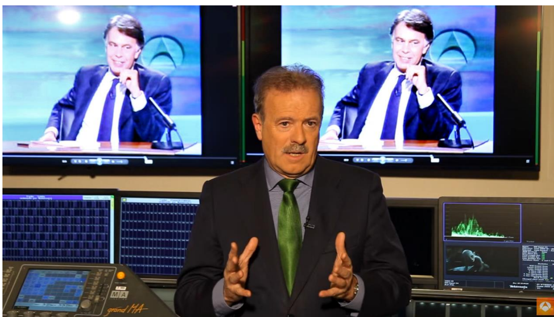
Figure 7. «El debate de Felipe González y José María Aznar: 25 años de historia».

A paradigmatic example of the institutional value of video footage is the face-to-face electoral debate between Spanish party leaders, Felipe González and José María Aznar, just prior to the Spanish general election in 1993 (Figure 7). In addition to its obvious historical value, this was the first televised debate of its kind in Spain, making it also valuable for the history of the media company itself. After all, footage illustrating an institution's major milestones is often used to highlight its authority or importance in its domain.