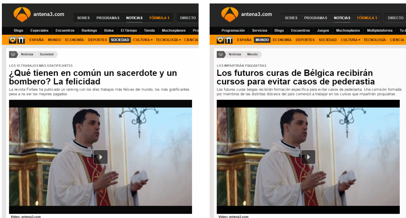
Figure 10. Shot of an identifiable priest, first used on a story about job satisfaction, later reused in a different story about pederasty.

Even if the material was originally recorded with the permission of the people featured, they can be offended by the reuse of these images if they are used to illustrate negative issues. For instance, footage of an identifiable person having a drink should not be used to illustrate the problem of rising rates of heavy drinking. Those affected, be they individuals or companies, can seek legal action against the broadcaster. An example of this kind of misuse is shown in Figure 10.