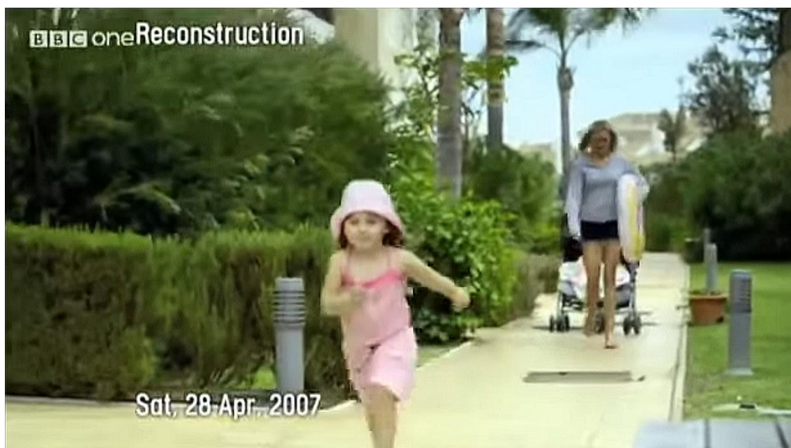
Figure 9. Reconstruction of the disappearance of Madeleine McCann.

Fictional footage or the reconstruction of events can be used in documentaries because of lack of actual footage or to visually enrich the production, but it should not be presented as actual footage. Instead, its origin must be clearly stated both on screen and in the archive database (Figure 9).