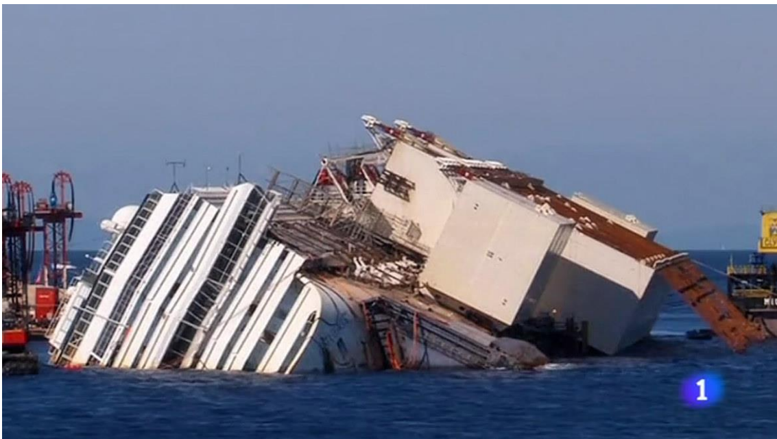
Figure 8. «Condenan a Schettino a 16 años de cárcel por el naufragio del Costa Concordia».

A good case in point is the coverage of the Costa Concordia disaster, which was not a simple one-off event, but rather the beginning of a recurring set of related events. After the cruise ship capsized and sank, the story regained international attention on two further occasions: first, twenty months after the disaster, when the refloating operation was begun; and, second, three years later, when the captain was sentenced. Every breaking story reused footage from previous pieces (Figure 8).