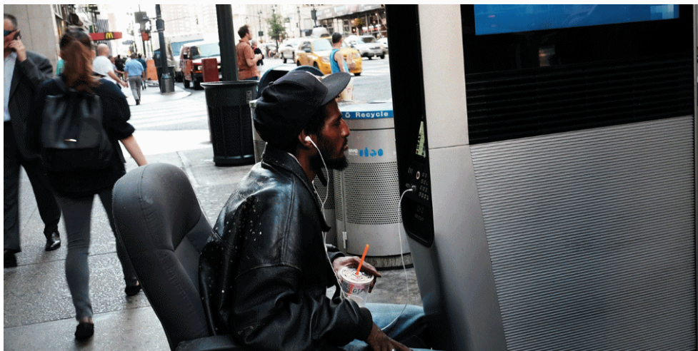
Figure 11. Identifiable person shown on a news story with negative connotations.