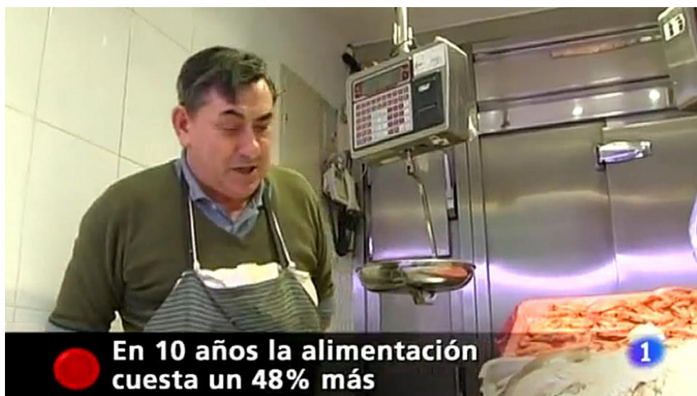
Figure 5. «Algunos las prefieren rubias».

among other events that have occurred during the euro era. Taken together, such footage offers interesting insights and enables us to chart the changing face of our society.