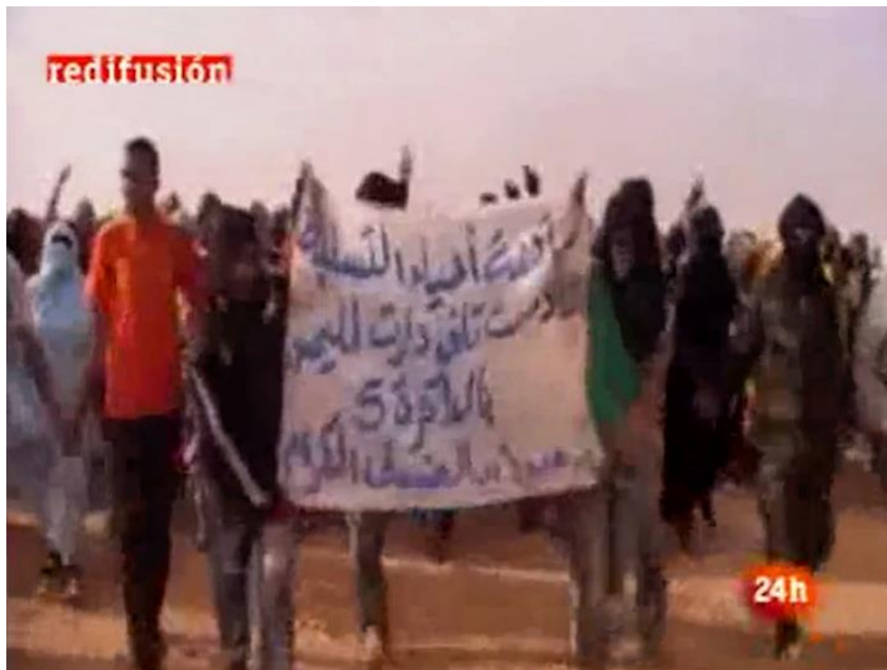
Figure 2. Footage used in the news story «La intifada saharai».

A good example of the use of such information sources is provided by a weekly news program, Informe semanal (Weekly report), on Televisión Española , Spain's national state-owned, public-service television broadcaster. Following the ban placed on the world's media by the Moroccan government in 2010 from entering the city of Laayoune to report on clashes, the news story La intifada saharai (The Sahrawi Intifada) included videos uploaded to YouTube by activists of the Thawra association that denounced the plight of the Sahrawi people (Hidalgo & López, 2014) (Figure 2).