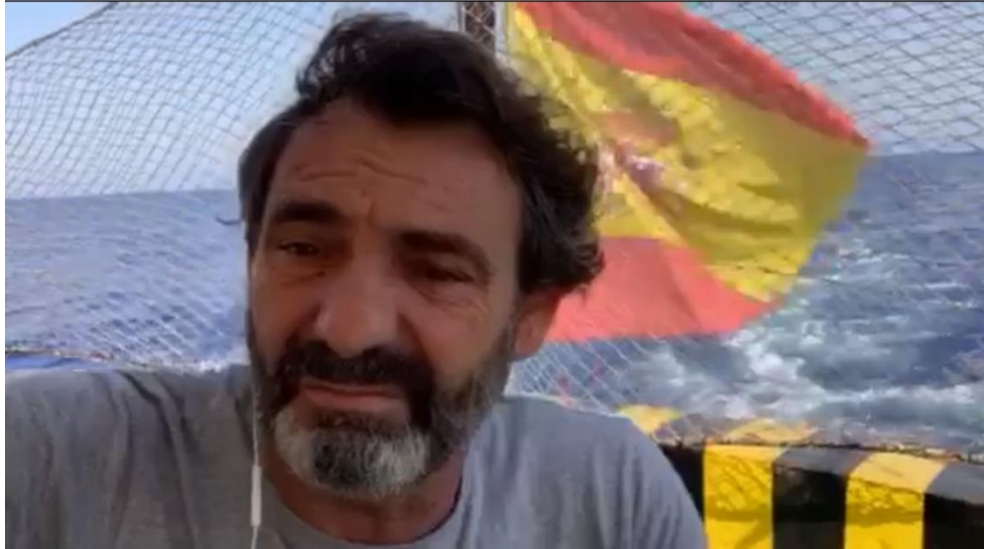
Figure 3. One of the videos posted on the Open Arms' Facebook account denouncing the blockade of the humanitarian ship.