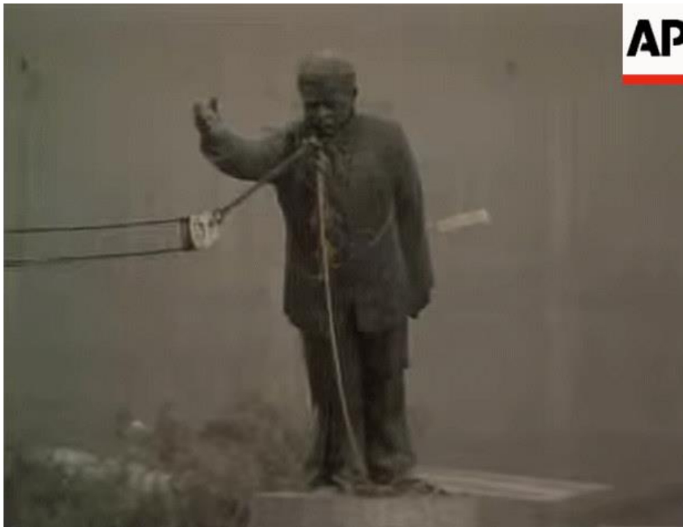
Figure 4. Broadcast of the destruction of the statue of Saddam Hussein.

of bronze. The scene broadcast live worldwide became an icon of the war, a symbol of final victory over Saddam Hussein» (Figure 4).