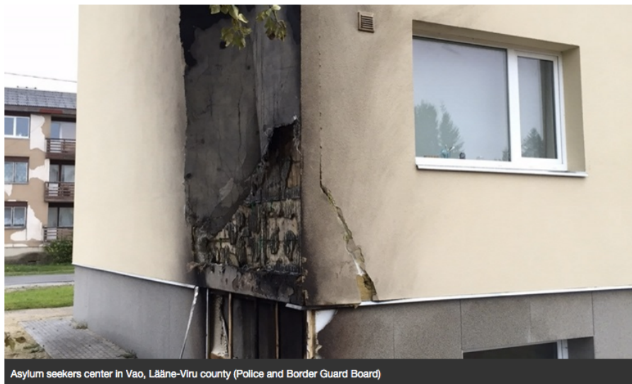
Asylum seekers center in Vao, Lääne-Viru county