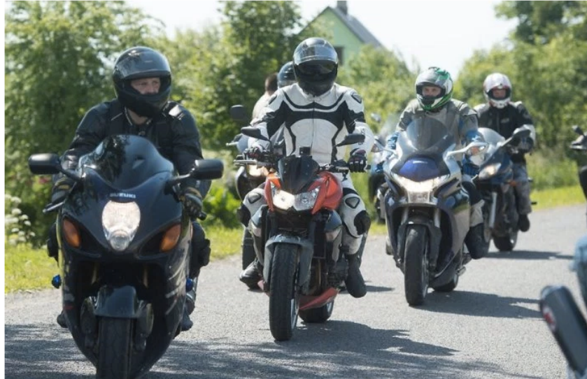
Biker Scum of Vao village.

In the city of Vao in northeast Estonia the municipal authorities evacuated a refugee camp on Saturday because of a protest ride by around 360 bikers against enlargements to the camp