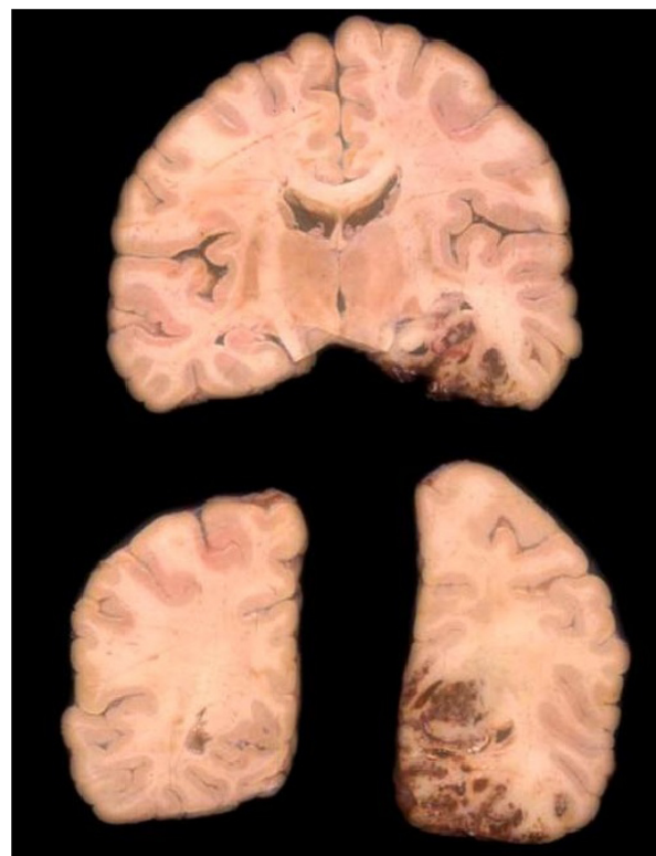
Figure 1 Pathological specimen showing a hemorrhagic cerebral infarction of cardioembolic origin in the vascular superficial distribution territory of the posterior cerebral artery.

Salient clinical manifestations of CI (Table 1) include sudden onset of neurological deficit, maximum focal neurological dysfunction at the onset of clinical symptoms, stroke onset while awake, speech disturbances, and the presence of a non-lacunar clinical syndrome. 24 Early differential diagnosis of CI should be mainly established with atherothrombotic infarctions, and sometimes, this differential diagnosis can be difficult on the basis of clinical symptoms alone. 20 However, in a comparative clinical study, it was found that sudden onset of neurological deficit and heart rhythm disturbance were independent predictive variables of cardioembolism, whereas hypertension, diabetes, dyslipidemia, and chronic obstructive pulmonary disease (COPD) were significantly related to atherothrombotic infarction. 20 Also, atrial fibrillation, heart valve disease, and ischemic heart disease are characteristic cardiovascular risk factors for CI, in contrast