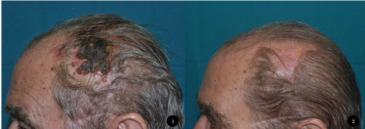
FIGURE 1. (1) Temporoparietal necrotic ulceration at presentation. (2) Alopecic area after 3 months of corticosteroid therapy.