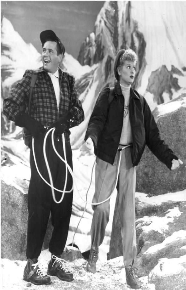
Publicity photo of Lucille Ball and Desi Arnaz in I Love Lucy