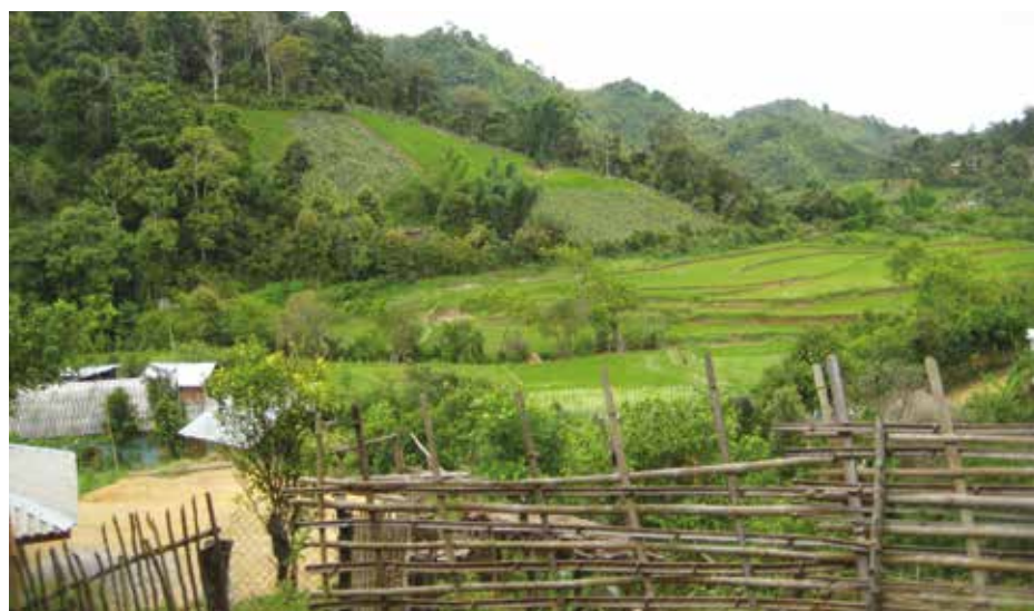
Figure 1: Land-use systems are often mosaics, incorporating multiple forms of land use simultaneously. In this village in the Philippines, irrigated rice fields are grown near the settlement, while the hillsides are used for swidden farming. This land-use regime would be classified as agriculture in level 1 of the LandCover6k land-use classification (Fig. 2), flooded-field farming and swidden in level 2, and rice paddy/taro pondfield in level 3. Domesticated animals and crops would be coded separately.

Agriculture is the most internally diverse land-use class, reflecting both its history and significance to landscape transformation. The level 2 classification of agricultural forms (Fig. 2) is therefore the most finely subdivided. Not all croplands are