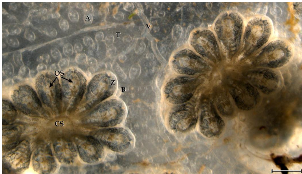
Figure 1. Colony of the ascidian Botryllus schlosseri . In this species, zooids are grouped in star-shaped systems (two systems are visible here), and stem cells assure the rejuvenation of the colony through either the cyclical production of pallear buds, or the whole body regeneration (also known as vascular budding), when all the zooids and buds are ablated and new zooids originated from the hemocytes in the tunic vasculature. A: ampulla (blind, contractile ending of the tunic circulation); B: bud; CS: cloacal siphon of the system; OS: oral siphon of the zooids; T: tunic; V: tunic vessel; Z: zooid. Scale bar: 1 mm.

Recent studies have shown that the best organisms for stem cell research are the marine/aquatic invertebrates. These organisms possess numerous types and lineages of stem cells that can offer, once studied in the lab, important clues to the understanding of stem cell biology. Stem cells are present in either (morphologically) simple marine/aquatic organisms, such as cnidarians, sponges, and flatworms, or in anatomically more complex taxa, such as crustaceans, echinoderms, and protochordates (urochordates and cephalochordates) (Figure 1). Unique to many of the aforementioned marine invertebrates is the property that some adult MISCs are pluripotent, capable of developing both the germ line and somatic tissues, and are involved in asexual reproduction and regeneration. Marine organisms challenge the prevailing dogmas on stem cell structures, niches, and cell lineages biology. They also challenge the existing concepts on the genetic and epigenetic control of stem cell differentiation. Due to their simpler morphological and tissue organization and the accessibility of some of them to genetic manipulation, marine/aquatic invertebrates are reliable and efficient model systems to investigate the molecular basis of stemness and stem cell regulation. This problem can be solved by analyzing the molecular interactions between stem cells and their niches, under controlled in vivo conditions.