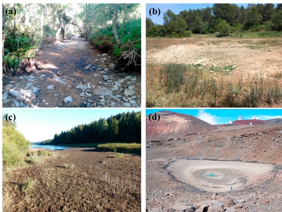
Fig. 1. Photographs of representative dry inland waters. (a) Fuirosos stream (Catalonia, Spain) showing its dry stream bed; (b) Collada pond (Catalonia, Spain); (c) Königshütte reservoir (Saxony-Anhalt, Germany); (d) Lake Waiiau (Hawaii, USA).

and rivers) and lentic (ponds, lakes, and reservoirs) ecosystems in which surface water is absent, and sediments become temporarily or even permanently exposed to the atmosphere (see some examples in Fig. 1). A large part of the global river and stream network shows ephemeral or intermittent flow regimes, i.e. their flow ceases with varying frequency and duration, exposing the sediments of the riverbed to direct contact with the atmosphere (Fig. 1A). Most small ponds seasonally dry at least partially (Fig. 1B), and man-made reservoirs experience recurrent water level fluctuations that expose large areas of sediments to the atmosphere, particularly in the inflow sections (Fig. 1C). Finally, lakes can also totally or partially dry due to changes in climate and water diversion, exposing bottom sediments (Fig. 1D). The dry sections of inland waters tend to be highly dynamic and contract and expand over space and time, thereby occupying a varying fraction of the aquatic network (Stanley et al., 1997). In addition, exposed sediments of inland waters may be subject to different drying intensities due to groundwater influence and rainfall, thus maintaining different levels of moisture after surface water loss (Steward et al., 2012).