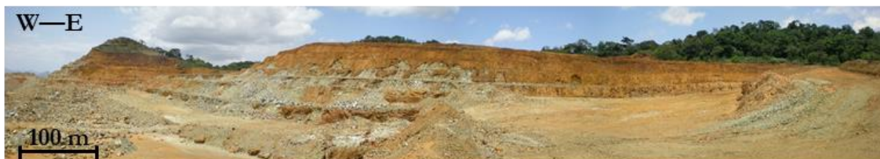
Fig 1. Field view of the investigated Ni-laterite profile from the Loma de Hierro deposit (Venezuela).

Samples were collected in March 2017. Major and minor element concentrations were determined by XRF and ICP-MS at the Actlabs Laboratories (Canada). Thin and polished sections were studied by optical microscopy. SEM-EDS, EMP and XRD measurements were performed at the Centres Científics i Tecnològics of the UB (CCiT-UB, Spain) and mineral quantitative analyses were performed by the Rietveld method using the TOPAS V4 software.