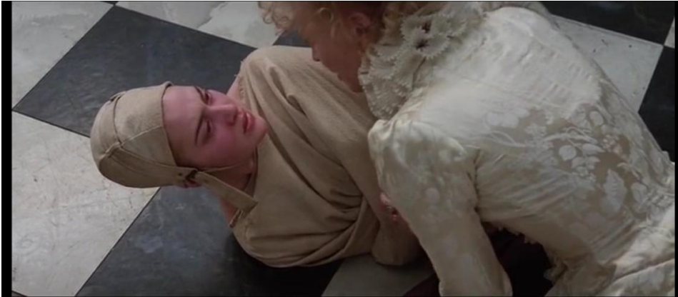
Fig. 4 Ophelia (Winslett) is wearing a straitjacket after she has lost her father and her mind.

violence turns to slow, horrified recognition and her stricken face stares from the poisoned chalice to Claudius, this whole fatal ‘history’ a series of quick intercuts ‘behind’ the main action. (2000, p. 253)