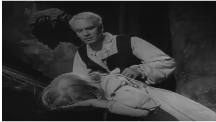
Fig. 2: Ophelia (Simmons) crying on the stairs in a position similar to that of a rape victim while Hamlet (Olivier) leans over her and whispers "To a nunnery, go."

All in all, Rothwell reaches an interesting conclusion about the representation of women in Olivier's Hamlet : "Ironically the movie is not about a man who couldn't make up his mind but about a man who couldn't relate to women [...]. Hamlet's ruin stems from his Oedipal complex and corollary total inadequacy for dealing with Ophelia" (1999, p.57)