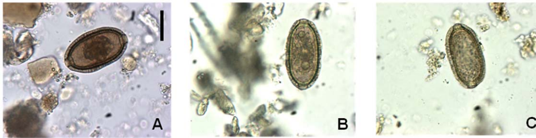
Figure 2. Eggs of Calodium hepaticum in stool and liver tissue. A. In human stools, B. In peccary liver tissue, C. In dog feces. Scale = 31 \mu\text{m} (all images).