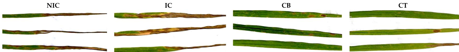
Figure 2. Pearson's correlation matrix of seed coating treatment on SLB symptoms in 3 representative leaves of wheat (2017 year of study). NIC: non-inoculated control, IC: inoculated control, CB: coated with PsJN strain, CT: coated with thyme oil.

The F values are shown, and the symbols indicate statistical significance (*, p < 0.05 ; **, p < 0.01 ; ***, p < 0.001 ), values with different superscript letters are significantly different classes according to the LSD test ( p \leq 0.05 ). LSD: Least significant difference; NIC: non-inoculated control; IC: inoculated control; CB: coated with PsJN strain; CT: coated with thyme oil.