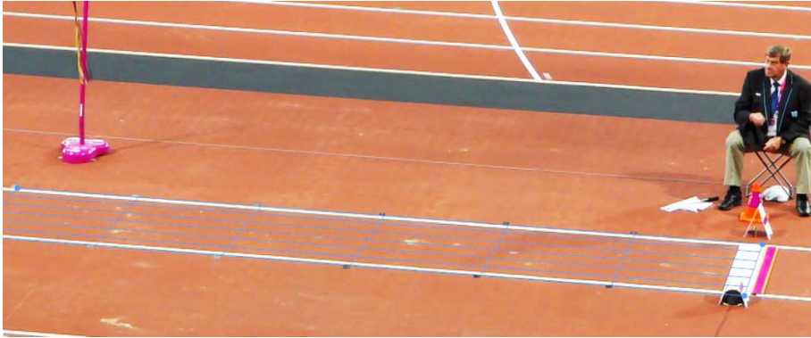
FIGURE 1: The calibration of the approach run was with white markers (5x5cm) in the Olympic Stadium (London 2012).

shoes placed at known distances along the runway (Theodorou & Skordilis, 2012; Theodorou, Skordilis, Plainis, Panoutsakopoulos, & Panteli, 2013).