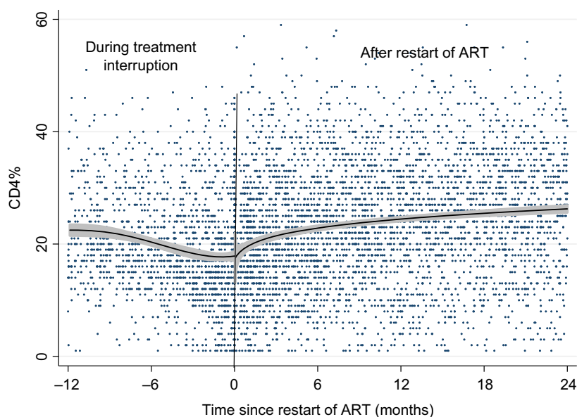
Fig. 1 Observed CD4 percentage (CD4%) during first treatment interruption (TI) and in the 24 months following restart of antiretroviral therapy (ART).

ART interruptions occurred in just over 1 in 10 children and adolescents living with HIV. In our large data set from several cohorts in Europe and Thailand, we found that 12% of children who started ART had a TI. The first TI occurred at an average age of 10 years after 5.5 years on cART, with 21% having a further TI. This proportion of children with a TI is lower than that reported in a French cohort (42%) [14] and in a US cohort (18%) in 2008 [15]. Duration of TIs varied from a median of 9 months in our study, to 12 months in the French study and 14 months in the US study. Moreover, TIs occurred at a median age of 10.1 versus 8 years in the French cohort and 12.8 years in the US cohort. Detailed comparisons among studies are difficult and differences in definitions of TI (we defined a TI as a 1-month interruption), availability of treatment and calendar period of enrolment may explain differences in the proportions