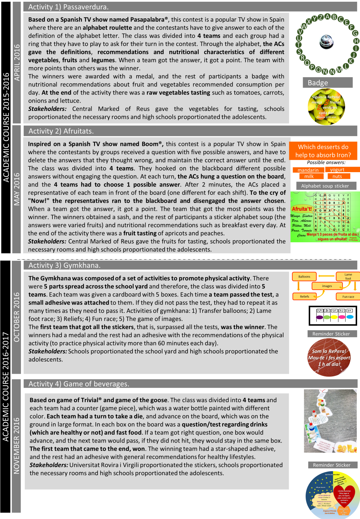
Figure 1 Activities in the European Youth Tackling Obesity-Kids project designed and implemented by adolescent creators (ACs).