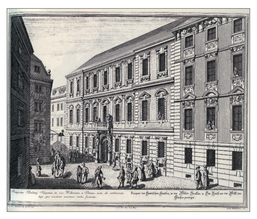
Fig. 5: Council of Spain in Vienna (Salomon Kleiner, Iohann August Corvinus, 1724–1737).

the presence of exiles in the Ottoman-Venetian War (1714–1718), which, as it had happened in the previous disputes with the Turkish Empire, generated some popular consumption sheets. The silver figurines commissioned by the count of Alcaudete, with the keys of Temeswar and Belgrad, remain in the warehouses of the monastery of Guadalupe, far away from the public eye of the parishioners, where they were presumably deposited from the very beginning. The Narraciones históricas (Historical narrations) of Francesc de Castellví remained unpublished in the Vienna State Archive until the end of the twentieth century. And, in any case, the exiled chronicler also did not have much interest in explaining his stay in the Banat of Temeswar, which always considered an episode to be forgotten. No works published in Spain refer to any of these episodes before 1979.