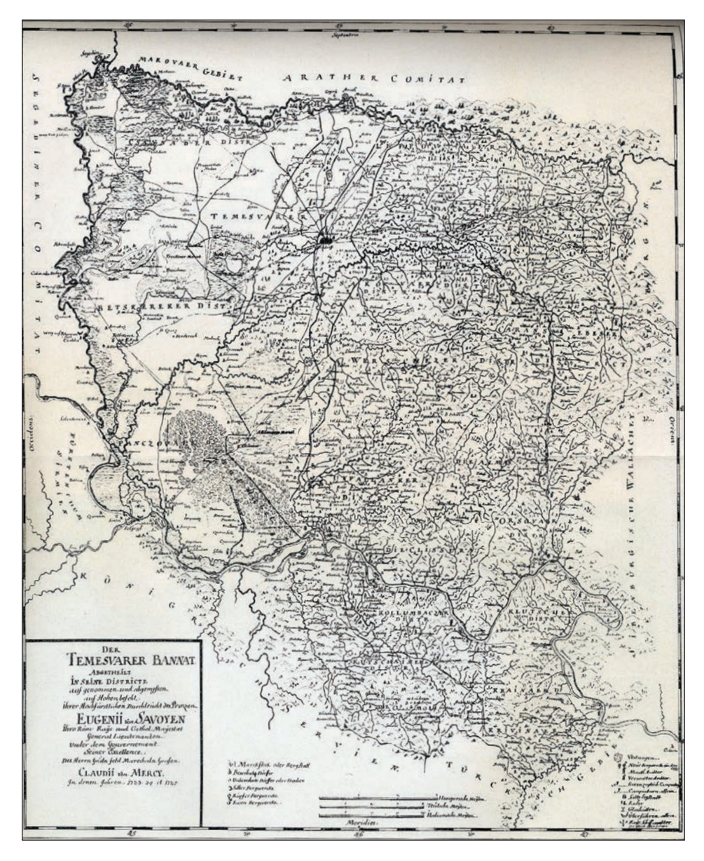
Fig. 3: The Banat of Temesvar in 1718–1739.

So observed, construction of the Spanish exiles' "new fatherland" seems almost a reasonable endeavour. The group would have land to develop and, as a trade-off, the Empire's frontier territories would be occupied by demonstrably trustworthy souls.