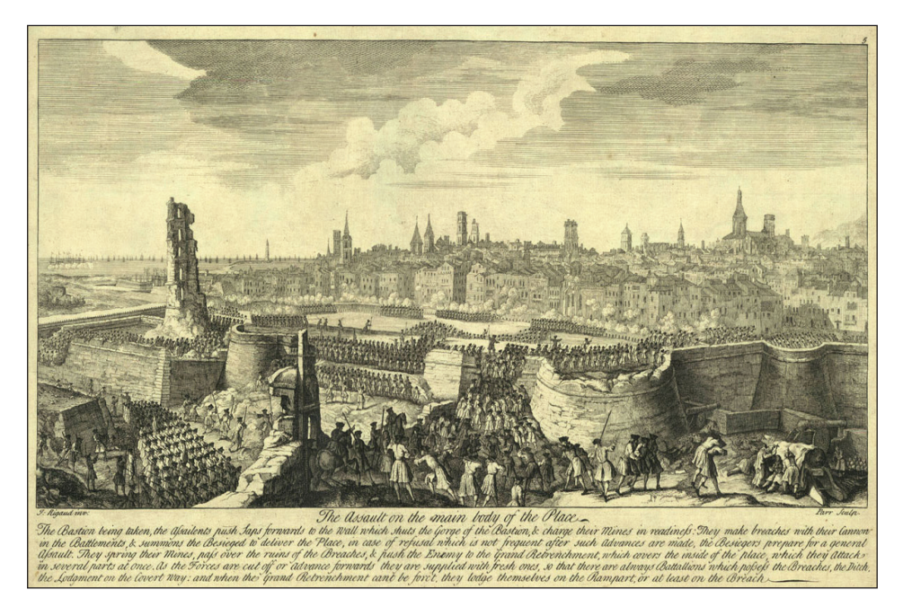
Fig. 4: Barcelona, September 11, 1714, Jean Rigaud.

Agustí ALCOBERRO: FROM BARCELONA TO TIMIȘOARA AND BELGRADE –WITH STOPS IN VIENNA ..., 255–278