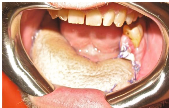
FIGURE 6: Postoperative intraoral image.