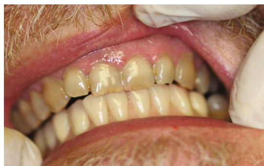
FIGURE 10: Intraoral image of the hybrid prosthesis placed into the mouth.