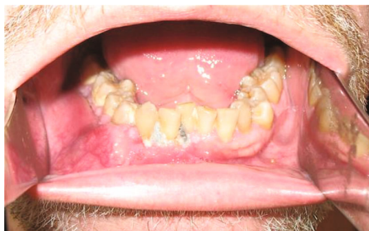
FIGURE 1: Intraoral image of the lesion. Note the swelling on the right mandibular premolar region.

One year and 5 months later, a biopsy of the peri-implant tissues on the left side was performed to rule out recurrence of ameloblastoma. The histopathological diagnosis was granulation tissue with epithelial hyperplasia without atypical changes.