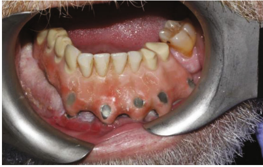
FIGURE 11: Intraoral image of the patient at the end of the treatment after a 7-year and 5-month follow-up.

tion of the tumor, prevents recurrence, and leads to a treatment with a faster and safer rehabilitation [6].