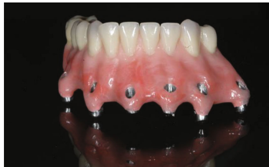
FIGURE 9: Frontal view of the finished lower hybrid prosthesis.