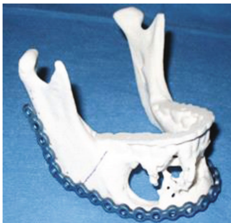
FIGURE 4: Stereolithographic surgical template from CT and reconstruction plate.