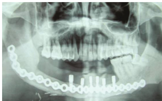
FIGURE 7: Orthopantomography after 6-implant placement on the fibula.

Because of the high rate of recurrence of ameloblastomas when a conservative surgery is performed, the gold standard of treatment in extensive lesions is tumor resection with \geq 1 cm safety margins [5]. Extensive curettages can compromise bone stability. This results in inadequate residual bone for implant placement, which can generate unpredictable results and long periods of oral rehabilitation. On the other hand, a surgery with safety margins ensures complete resec-