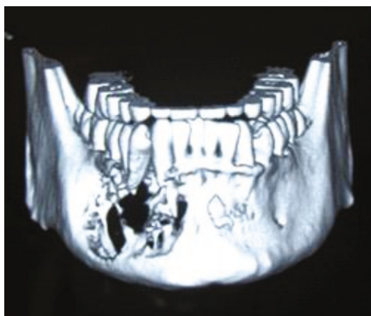
FIGURE 3: Preoperative computed tomography.

Six months later, the granulation tissue formation was observed on the right side. As a result, the prosthesis had to be removed. After a month, the tissues showed a clear improvement due to prosthesis removal.