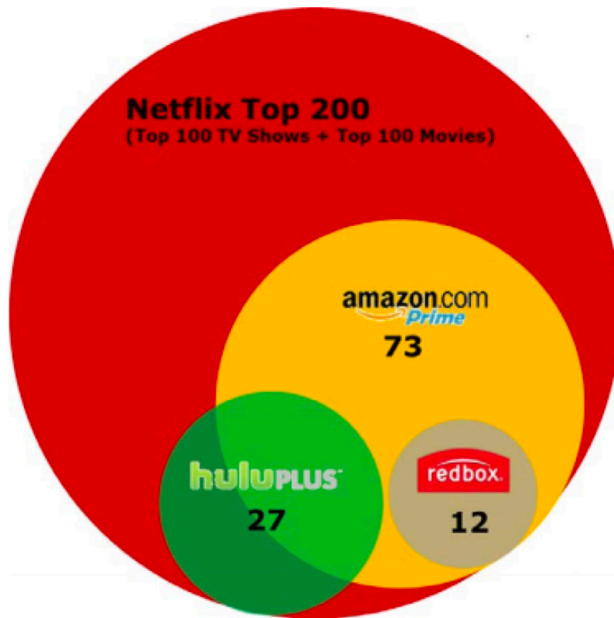
Figure 2: Netflix. Q4 12 letter to shareholders. Technical report, January 2013. http://ir.netflix.com/ .

As Figure 2 illustrates, Netflix is "becoming a producer and distributor of shows and movies with a fully global reach" (Gomez-Uribe & Co, 2015, p. 6) thanks to the intersection that exists between the Internet and storytelling. In other words, Netflix's business structures seem to be pretty much based on the different algorithms that both collect information from customers and provide them with an exclusive and unique experience that differs from the rest of the customers depending on the choices one might take. On the other hand, the availability of a whole season on streaming provides the customer with certain freedom, as it allows its consumption in different time intervals, either a more relaxed consumption or a binge-watching afternoon.